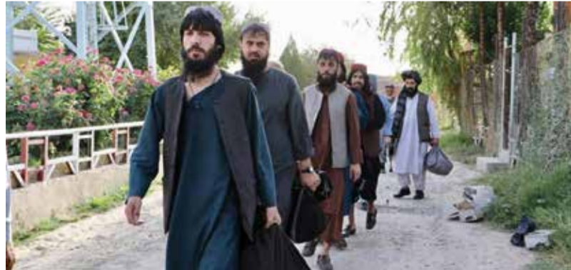
Taliban prisoners walk as they are in the process of being released from Pul-e-Charkhi prison on the outskirts of Kabul