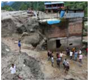
People during a rescue operation after a landslide in Nepal