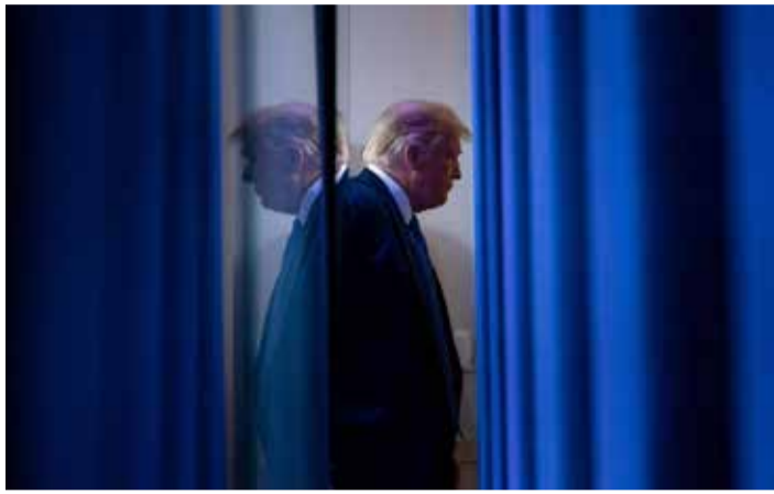
Donald Trump leaves the Brady Briefing Room after speaking to the press

“I heard it today that she doesn’t meet the requirements,” Trump said at a White House news conference on Thursday, referring to an August 12 opinion article in Newsweek.