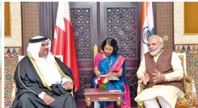
Indian Prime Minister Narendra Modi's historic visit to Bahrain last year was a milestone that would help to further cement the excellent ties between India and the Kingdom of Bahrain. Prime Minister Modi was honoured with "The King Hamad Order of the Renaissance" as he held talks with His Majesty King Hamad bin Isa Al Khalifa on various bilateral and regional issues. Narendra Modi also met His Royal Highness Prime Minister Prince Khalifa bin Salman Al Khalifa and His Royal Highness Prince Salman bin Hamad Al Khalifa, the Crown Prince, Deputy Supreme Commander and First Deputy Prime Minister, and discussed ways to strengthen the friendship between India and Bahrain, with a focus on business relations and cultural exchange.