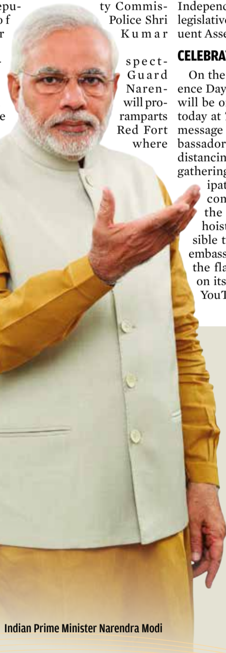
Indian Prime Minister Narendra Modi

After in- ing the of Honour, dra Modi ceed to the of the