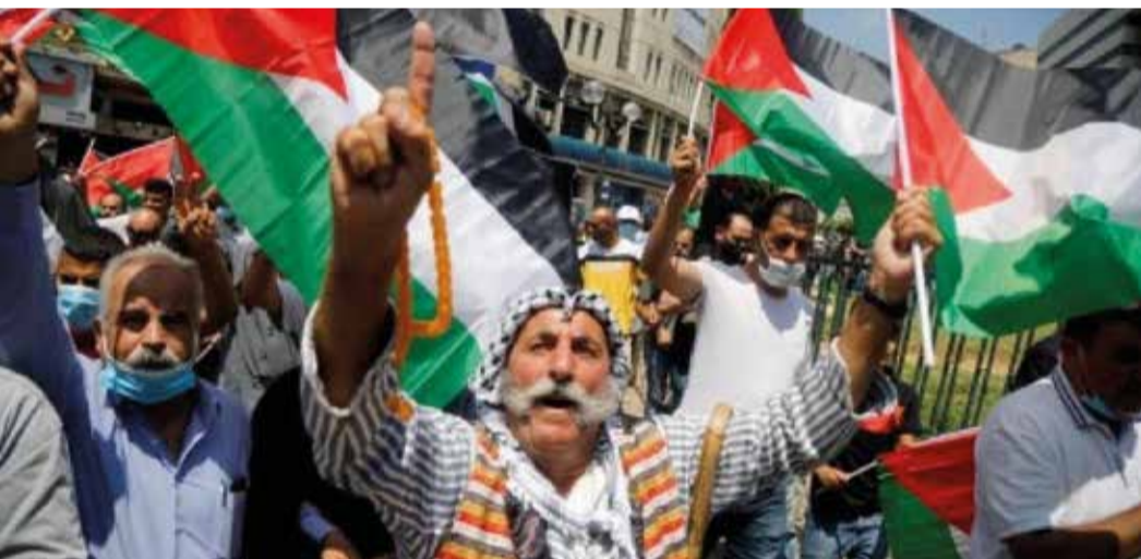
The accord was a rare triumph for Trump ahead of his Nov. 3 re-election bid.

GCC, world nations applaud UAE's peace deal