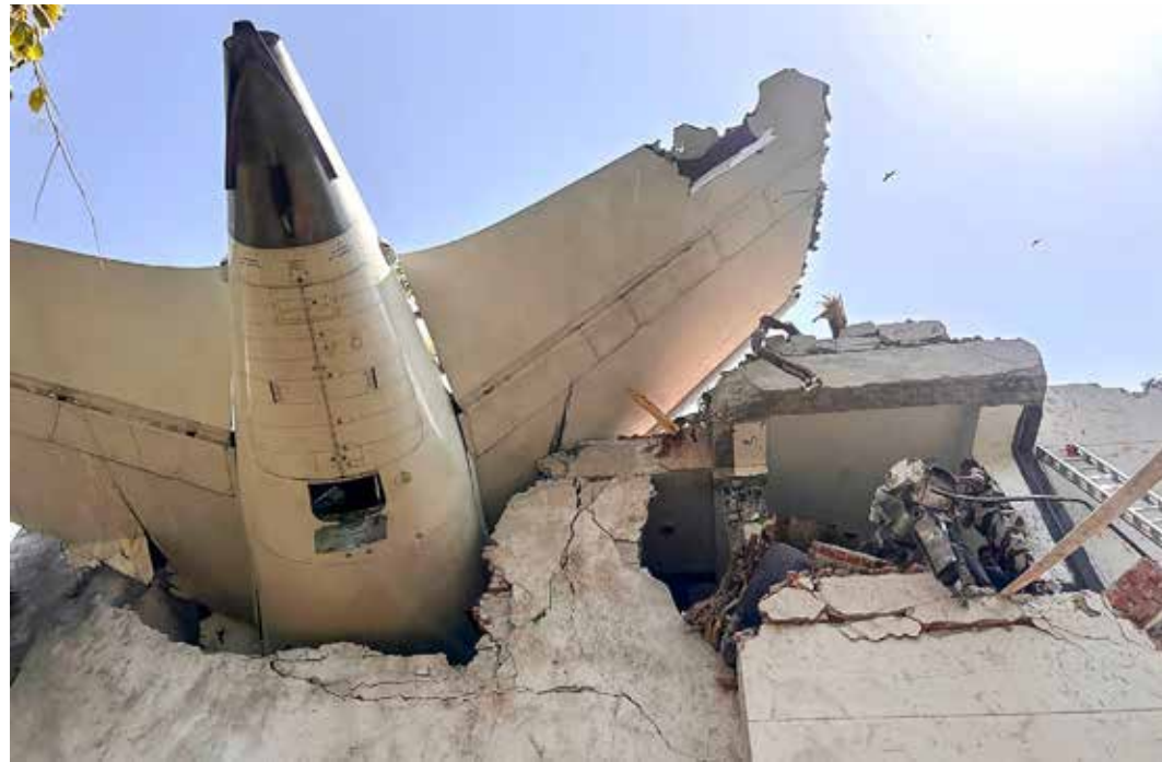
the tailpiece of Air India flight AI171 after it crashed in a residential area near the airport in Ahmedabad.

Association (ICPA) said it was "deeply disturbed by speculative narratives... particularly the reckless and unfounded insinuation of pilot suicide."