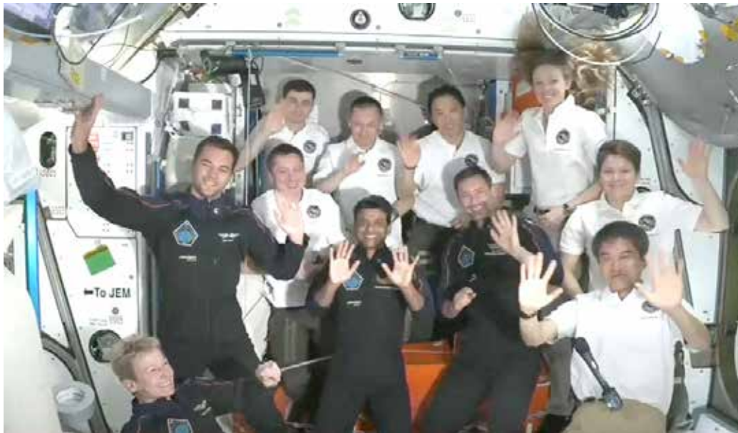
the Axiom Mission 4 crew inside the International Space Station's Harmony module shortly after docking aboard the SpaceX Dragon spacecraft. The Axiom crew, L/R in dark suits, are Commander Peggy Whitson, Pilot Shubhanshu Shukla, Mission Specialist Tibor Kapu, and Mission Specialist Slawosz Uznanski-Wisniewski.