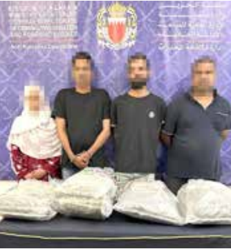
Suspects with the seized evidence

The Anti-Drug Directorate of the General Directorate of Criminal Investigation and Forensic Science, in cooperation with Customs Affairs, has arrested several individuals in separate incidents for attempting to smuggle and possess over 7 kilogrammes of narcotic substances, with an estimated street value of approximately BD121,000. The Directorate explained that upon receiving information related to the incidents,