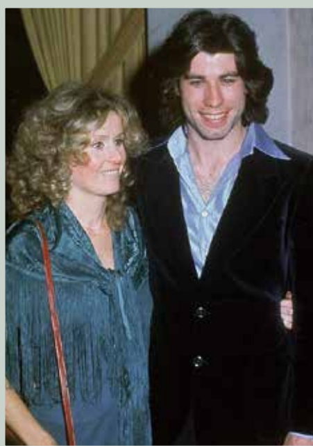
Diana Hyland and John Travolta

Hyland never had the career her young superstar boyfriend would go on to enjoy. Already the star of TV's "Welcome Back, Kotter," Travolta would make "Saturday Night Fever" in 1977 and the iconic movie-musical "Grease" in 1978 — a stretch of extreme success he'd never again repeat.