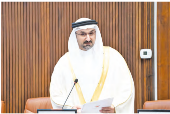
H.E. Abdulla Fakhro, Minister of Industry and Commerce

Medium-sized firms are those with 51 to 250 workers, or turnover above BD4m and up to BD20m.