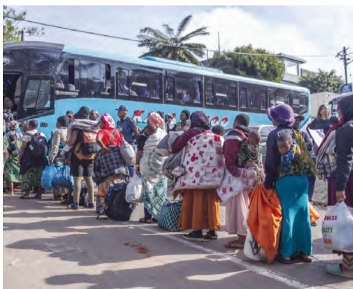
Migrants stand in a queue to board the first of seven buses at the Sherwood Park in Durban to travel back to Malawi.

Mobs of South Africans carrying sticks, whips and shields have marched through parts of the country ordering foreigners with no residency papers to