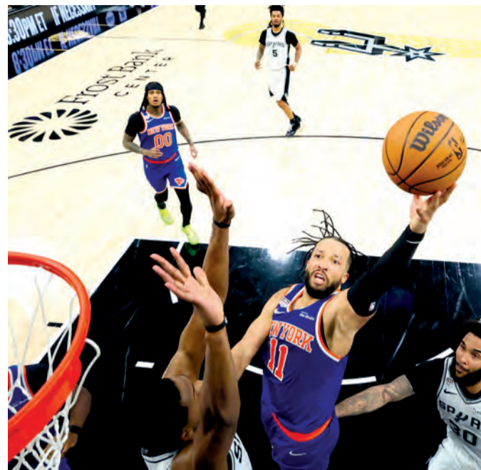
Jalen Brunson #11 of the New York Knicks drives to the basket