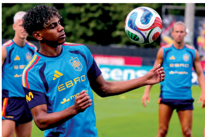
Lamine Yamal trains with Spain ahead of their World Cup opener