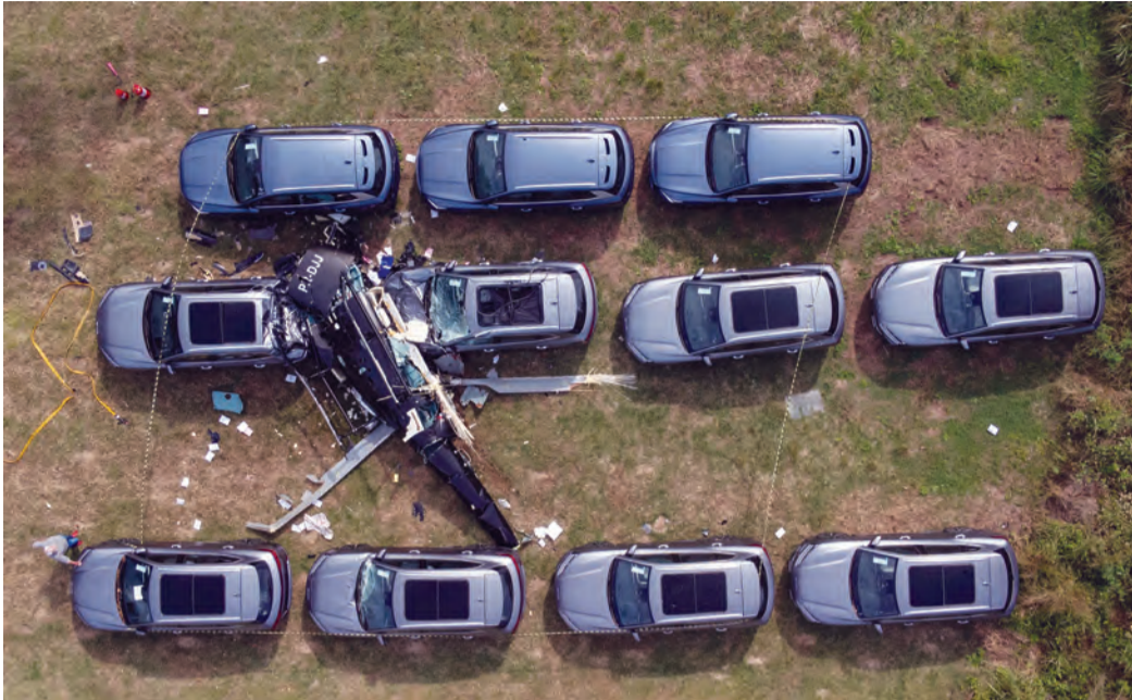
An aerial view shows the site of a helicopter crash in the Recreio dos Bandeirantes neighbourhood, in Rio de Janeiro, Brazil. At least six people died in Brazil after two helicopters crashed in western Rio de Janeiro, after a suspected mid-air collision, firefighters said.

German troops occupy Paris as French resistance to the German invasion crumbles