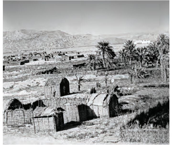
Summer settlements in Arad in the 1960s

Electricity changed the rhythm of daily life, and modern water networks reduced reliance on springs and natural water