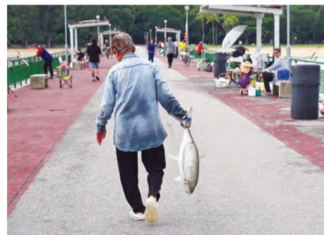
An angler carries a fish caught from a jetty at East Coast Park in Singapore