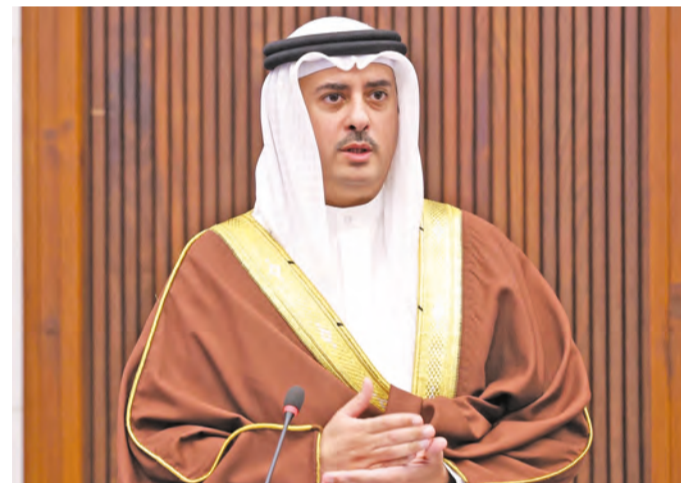
Nawaf Al Maawda, Minister of Justice, Islamic Affairs and Waqf

The parties will then have five working days from being notified of the mediation or-