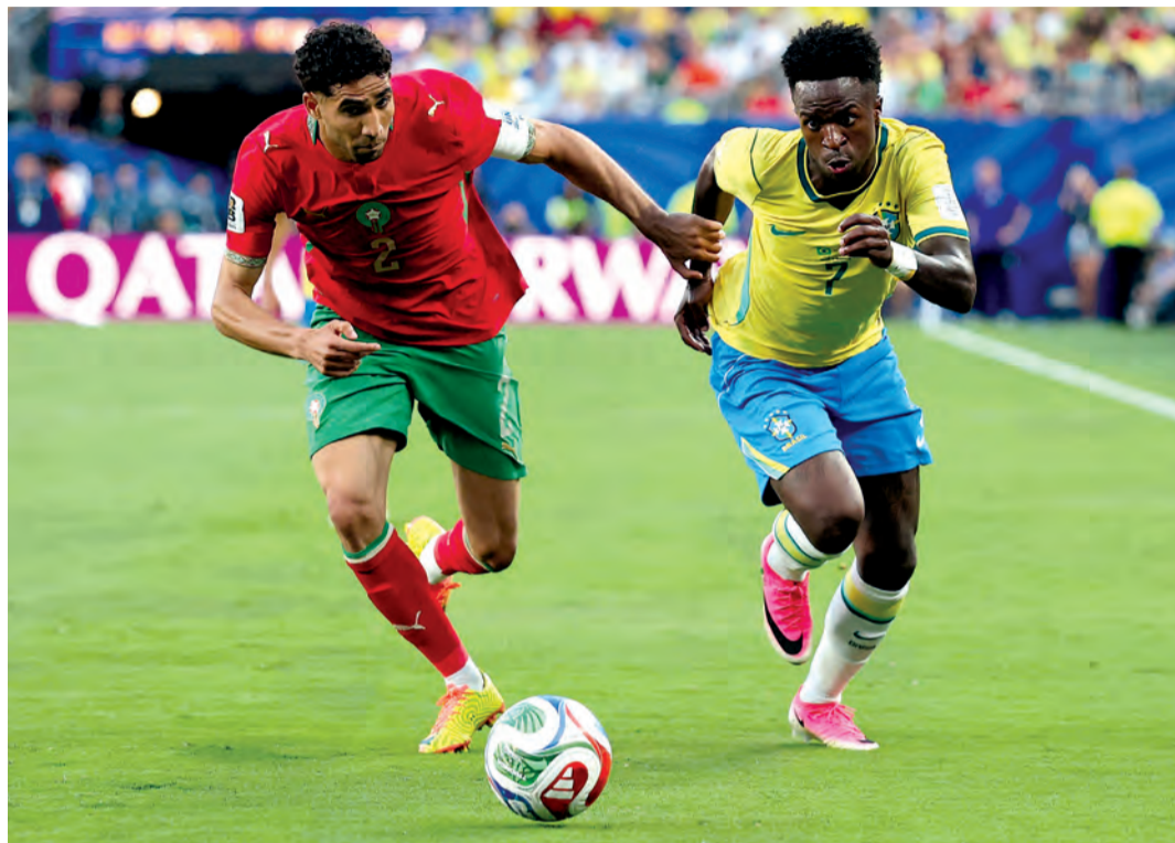
Achraf Hakimi #2 of Morocco competes for the ball against Vinicius Junior #7 of Brazil

Brazil have turned to the hugely successful Ancelotti a