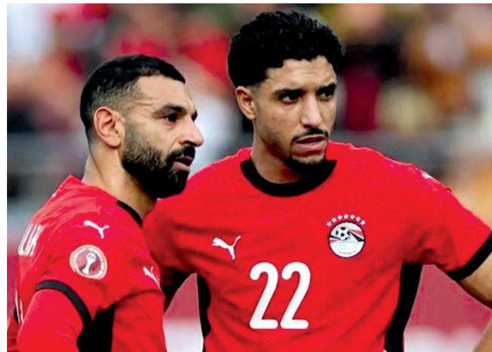
Egypt attacking duo Mohamed Salah and Omar Marmoush

Romelu Lukaku remains the focal point up front, though Gar-