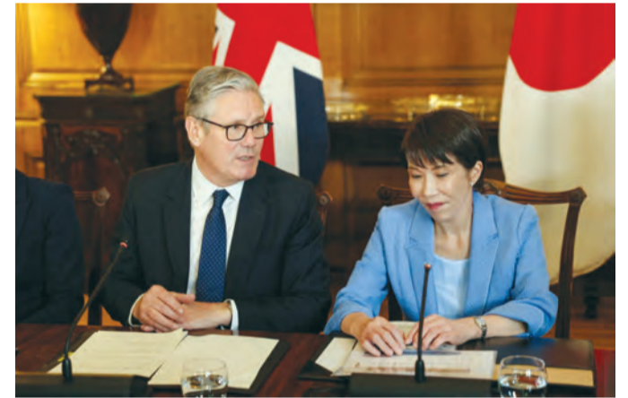
Britain's Prime Minister Keir Starmer (L) and Japan's Prime Minister Sanae Takaichi attend a business roundtable meeting at Downing Street in central London

● The meeting also included a roundtable discussion