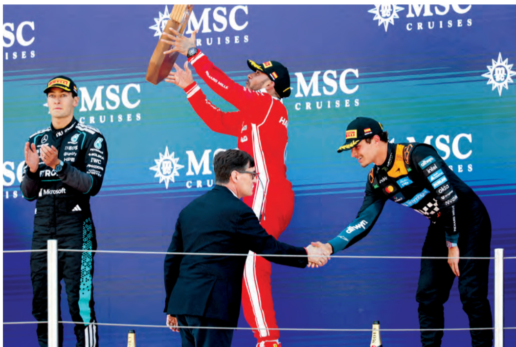
Winner Ferrari's British driver Lewis Hamilton, second placed Mercedes' British driver George Russell (L) and third placed McLaren's British driver Lando Norris (R) celebrate in the podium

at 51 degrees Celsius, Hamilton opted for a three pit-stop strategy and it worked to perfection, with the third of those fortuitously coming while the virtual safety car was deployed.