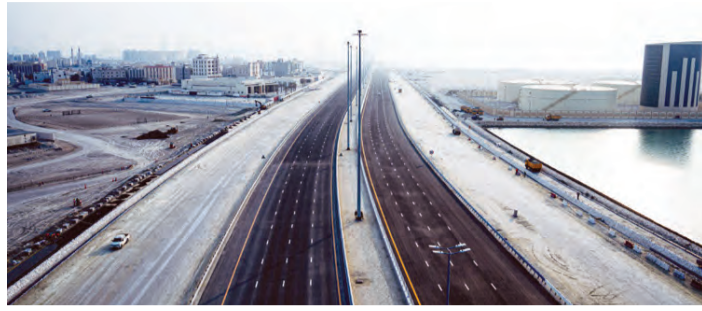
New Muharraq Ring Road Enhances

Muharraq is set to enhance its urban advertising landscape following a new agreement between the Muharraq Municipality and Batelco, part of Beyon, to operate and invest in 10 electronic advertising screen sites along the Muharraq Ring Road.