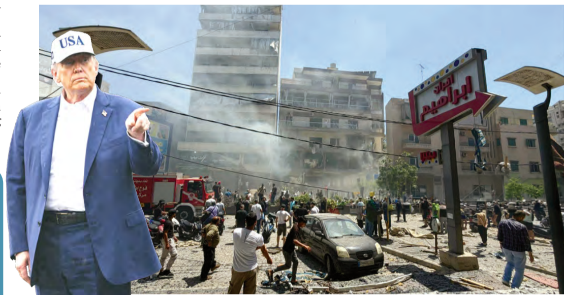
People gather at the site of an Israeli airstrike that targeted a building in Beirut's southern suburbs