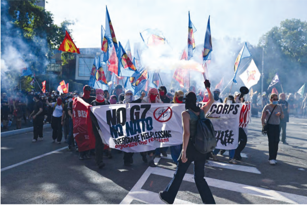
Demonstrators take part in a rally of a "No-G7" coalition of over 60 associations, unions and left-wing groups "against fascism and imperialism", a day ahead of the summit's start, in Geneva

The protesters later marched back to the demonstration's starting point, in a park on the