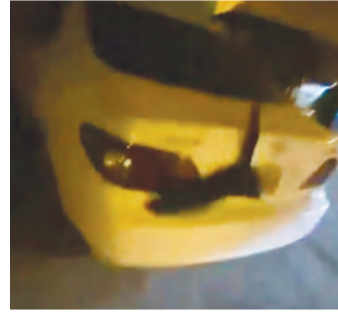
A snapshot from the video is circulating on social media

He has been held for seven days pending further inquiries