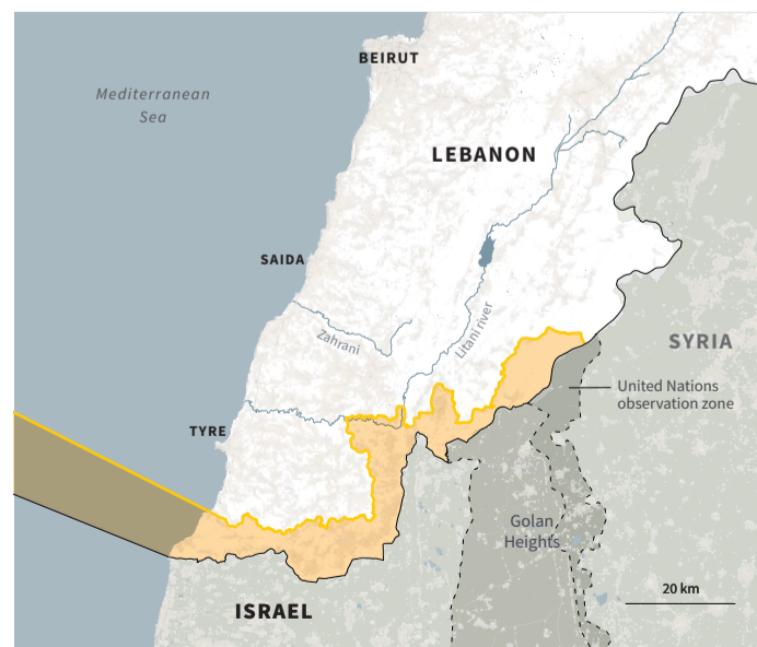
Southern Lebanon occupied by the Israeli army

A statement from the foreign ministry of Pakistan had also said that the deal's signing was planned for Sunday.