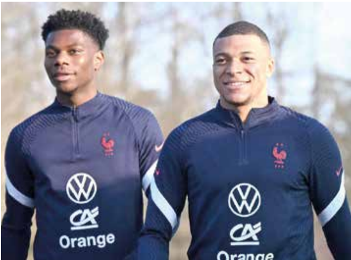
Kylian Mbappe (R) reacts with Aurelien Tchouameni during a training session (file photo)

“Kylian decided to stay in Paris and called me knowing that I would surely leave Monaco. But I told him right away that my first option was Real Madrid and he understood perfectly.”