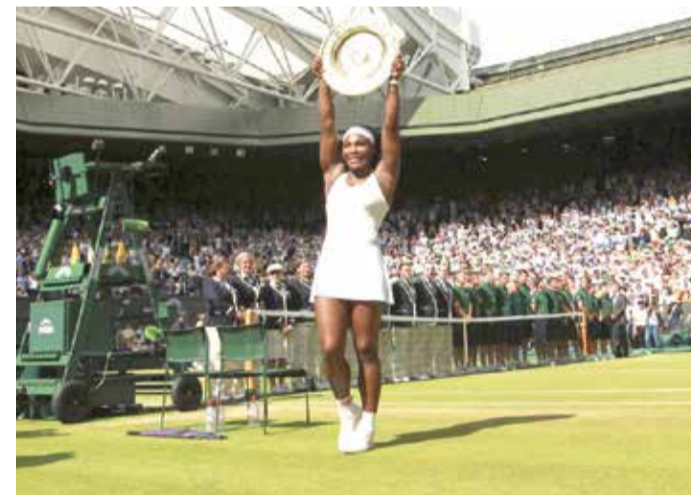
Serena Williams of the United States holds up the trophy after winning the women's title at Wimbledon in 2015 (file photo)

Williams won the last of her seven Wimbledon singles titles in 2016 but reached the final in 2018 and 2019 after returning