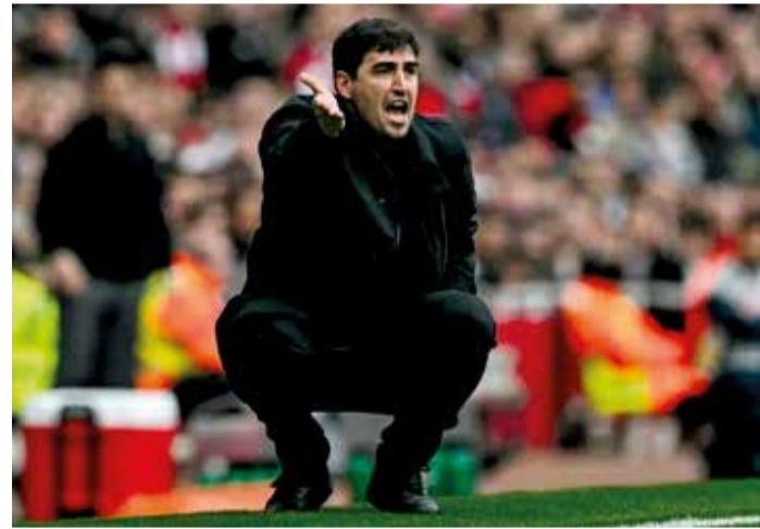
Bournemouth manager Andoni Iraola reacts during a match (file photo)

"It has been an honour to manage AFC Bournemouth and I am proud of what we have achieved together," said Iraola, who replaced Gary O'Neil as Bournemouth boss, in a club statement confirming his de-