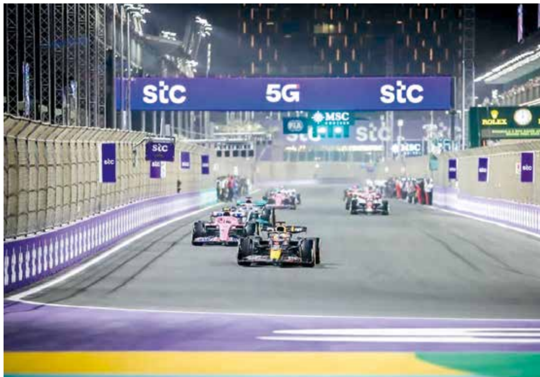
Action from the race at Jeddah Corniche Circuit (file photo)