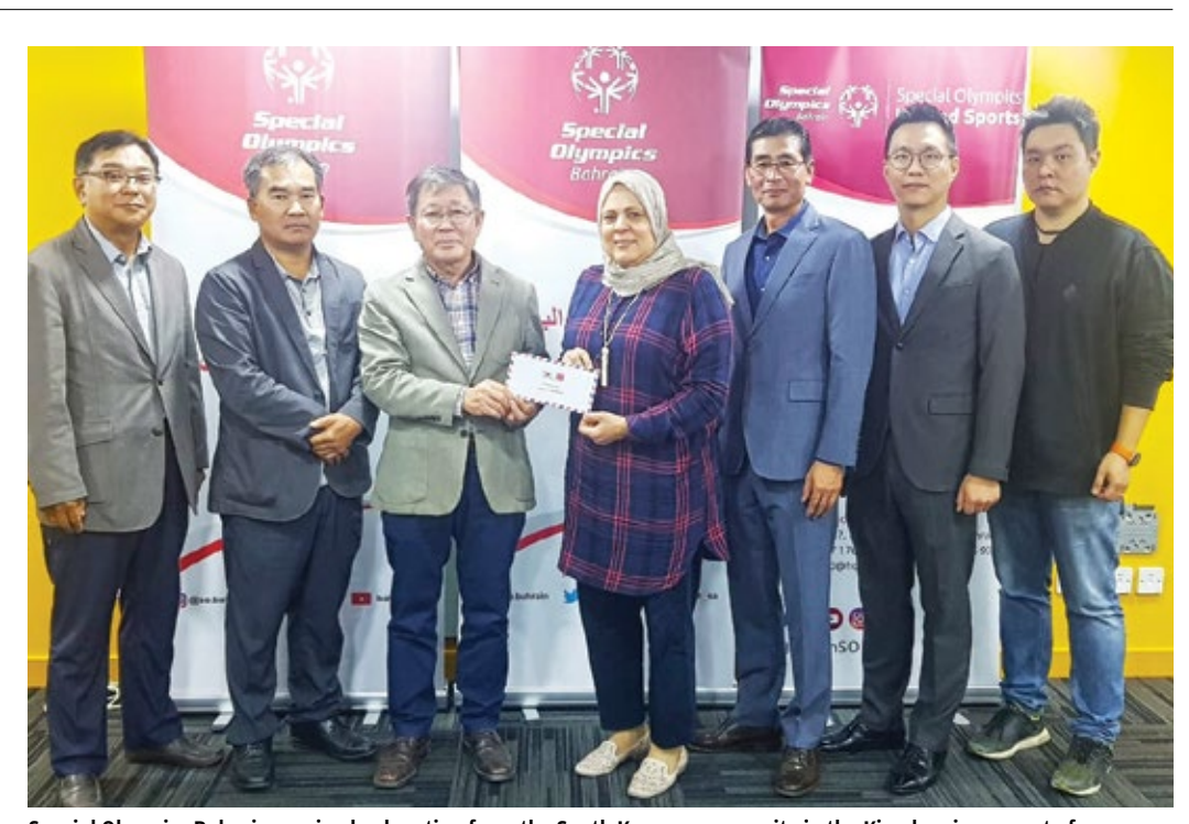
Special Olympics Bahrain received a donation from the South Korean community in the Kingdom in support of humanitarian efforts provided by the Bahraini Special Olympics.