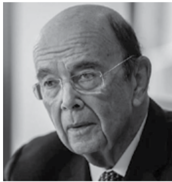
Wilbur Ross, US Commerce Secretary

The leaders met on the sidelines of the Group of 20 summit in Buenos Aires on December 1 and agreed to a 90-day truce while they tried to find a solution to the escalating trade dispute, but they provided differ-