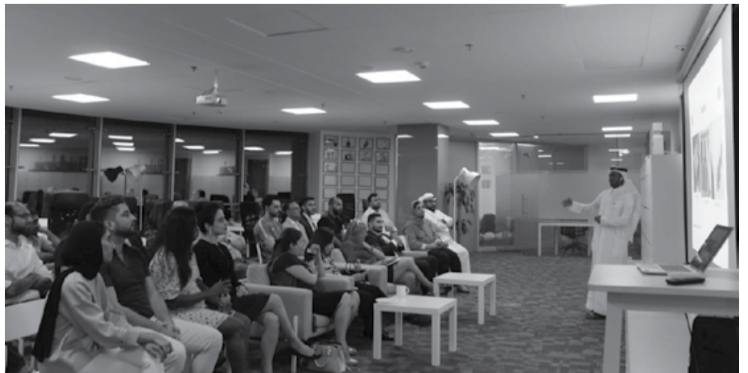
Startup owners listening to a presentation on the opening day