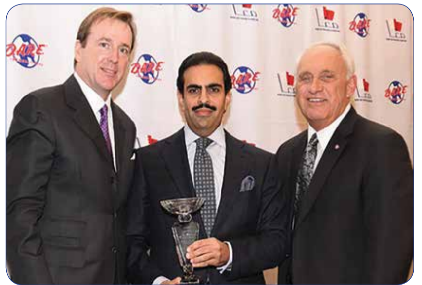
HE Bahrain Ambassador to the United States receives the award on behalf of HE the Minister

and collection of statistics. Since the GSS is part of the systems that operate within the general safety field, its tools for road works management allow for a better regulation of the daily traffic. A host of systems were introduced to speed up the responses in security situations and provide efficient, accurate and fast security services, including the Unified Criminal System, tracking patrols, identification of callers, identification of the callers' locations, and e-switchboard. As part of the new GCC apps, systems to facilitate the security control and provide advanced services were also introduced in 2018, including a system to trace nuclear radiation and environment pollution, and applications to manage resources and duties.