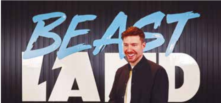
US YouTuber James Stephen "Jimmy" Donaldson, commonly known by MrBeast, smiles during an interview

"The majority of our audience is outside of North America and