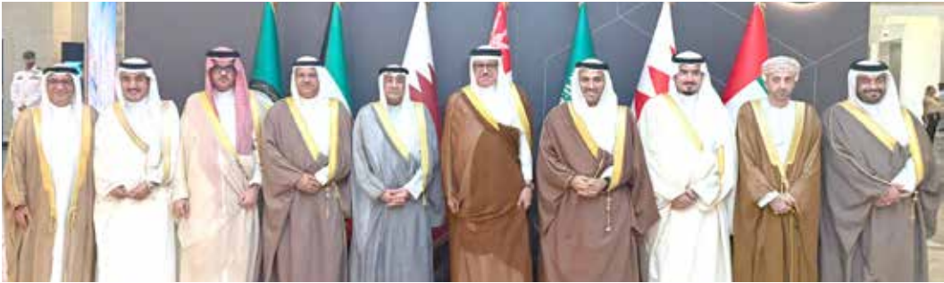
H.E. Dr. Abdullatif bin Rashid Alzayani, GCC Secretary-General Jasem Al-Budaiwi, and H.E. Ramzan bin Abdulla Al Nuaimi, Minister of Information, pose with ambassadors of GCC countries at the event

According to GCC Secretary-General Jasem Al-Budaiwi, the pilot phase will begin in December, connecting Bahrain and