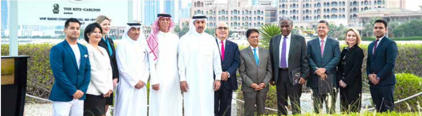
His Excellency Dr. Shaikh Abdulla bin Ahmed Al Khalifa, Minister of Transportation and Telecommunications, with The Ritz-Carlton, Bahrain officials

A new chapter in Bahrain’s maritime story is unfolding at The Ritz-Carlton, Bahrain, where the launch of the ‘Luxury Boat Culture’ experience at the Royal Marina echoes the Kingdom’s growing focus on nautical tourism. Rooted in the recently issued Edict (9), which allows sea vessels to secure navigation permits for multiple visits to Bahraini waters, the initiative ties luxury hospitality directly to the nation’s evolving yachting framework. Bold beginnings Anchored within the Royal Beach Club, the Royal Marina extends an open invitation to seafaring guests from across the region. Its new offering com-