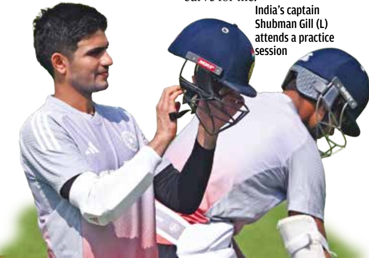
India's captain Shubman Gill (L) attends a practice session

"The challenge is definitely more mental than it is physical," Gill said. "Bodily, I feel fine. Mentally, it can be challenging at times because the requirements for different formats in different places of the world is different... it's a good challenge and a good learning curve for me."