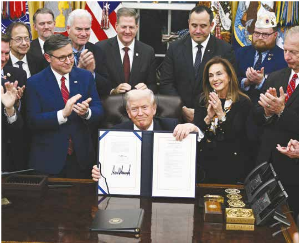
US President Donald Trump (C) shows the signed bill package to re-open the federal government in the Oval Office of the White House in Washington, DC

The 43-day funding freeze had paralyzed Washington