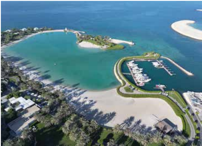
Royal Marina’s ‘Luxury Boat Culture’ initiative boosts the Kingdom’s growing tourism sector

bines modern elegance with personalised docking assistance and seamless immigration coordination, reflecting the hospitality standards that define The Ritz-Carlton name. The collaboration, the resort notes, pays tribute to Bahrain’s rich maritime heritage while reinforcing the national ‘Yachting in Bahrain’ agenda. By linking the hotel’s facilities to the wider Economic Vision 2030, the project mirrors the Kingdom’s aim to strengthen its reputation as a premier destination for yacht enthusiasts. Strategic shift ‘Luxury Boat Culture’ goes beyond docking, unfolding