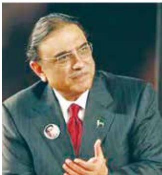
Asif Ali Zardari Islamabad, Pakistan