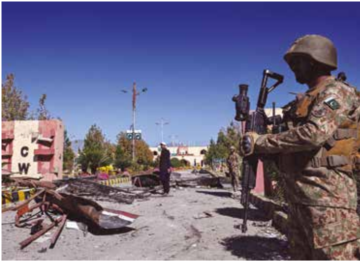
Pakistani military troops guard outside the damaged entrance after an attack on the Cadet College Wana, a military-linked school, in the South Waziristan district near the Pakistan-Afghanistan border

"It will be decided on a government-level what to do," the minister told reporters when asked how the government would proceed with regards to