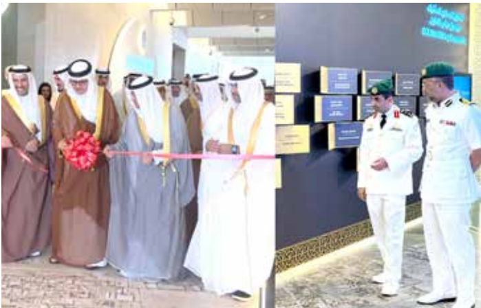
Ribbon-cutting ceremony of Bahrain's Pavilion

the UAE through air travel. If successful, it will later be implemented across all six GCC member states. “The one-stop system will simplify travel for citizens,