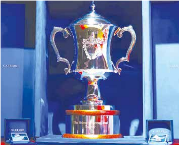
Bahrain International Trophy

The 7th edition of the Bahrain International Trophy promises an exciting evening of racing at Rashid Equestrian and Horseracing Club (REHC) in Sakhir, with the feature 2,000-metre Group Two contest set to run under floodlights at 7:40pm tonight. Wednesday's post-position draw, held at the Four Seasons Hotel Bahrain Bay, offered a glimpse of how the elite field