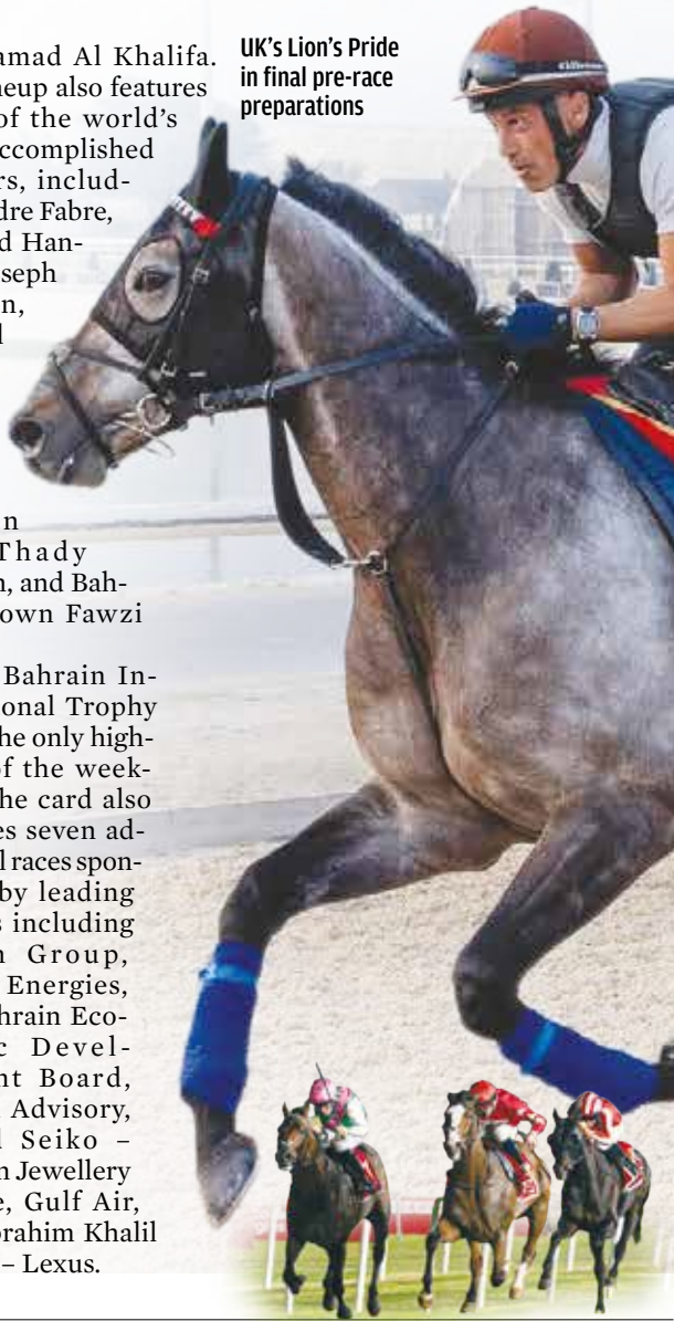
UK's Lion's Pride in final pre-race preparations

The Bahrain International Trophy is not the only highlight of the weekend. The card also features seven additional races sponsored by leading brands including Beyon Group, Bapco Energies, the Bahrain Economic Development Board, Brown Advisory, Grand Seiko - Bahrain Jewellery Centre, Gulf Air, and Ebrahim Khalil Kanoo - Lexus.