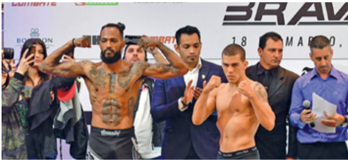
Brave CF's Pre-event press conference (file photo)

Athletes from 15 nations will take part in Brave 18. The pre-