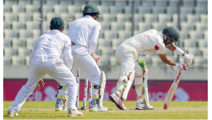
Zimbabwe cricketer Sikandar Raza (R) is bowled out