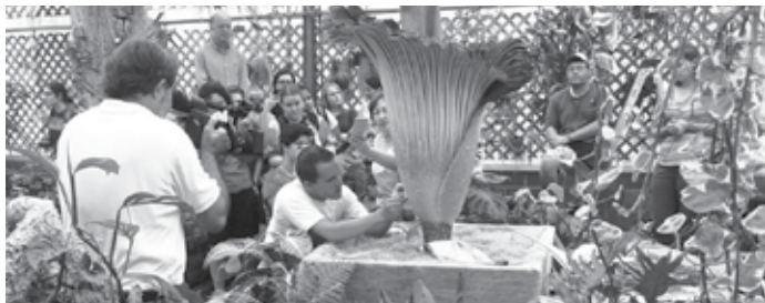
Representative picture.