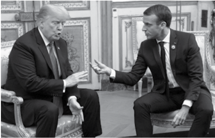
US President Donald Trump (L) speaks with French president Emmanuel Macron prior to their meeting at the Elysee Palace in Paris (file)

Donald Trump yesterday unleashed an extraordinary attack on Emmanuel Macron, mocking the French president's approval rating and lashing him over European defence proposals, on the heels of a rocky trip to Paris to mark the World War I centenary.