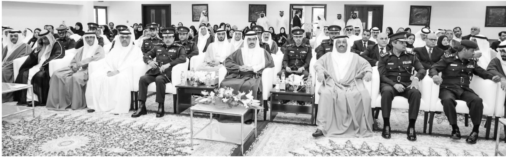
Shaikh Khalifa with senior government officials and dignitaries at the event.

Southern Governorate has prepared a line-up of events and festivities marking the golden jubilee