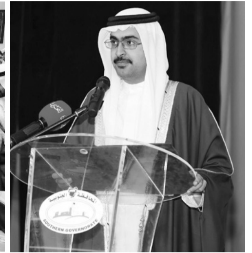
Shaikh Khalifa speaks on the occasion.