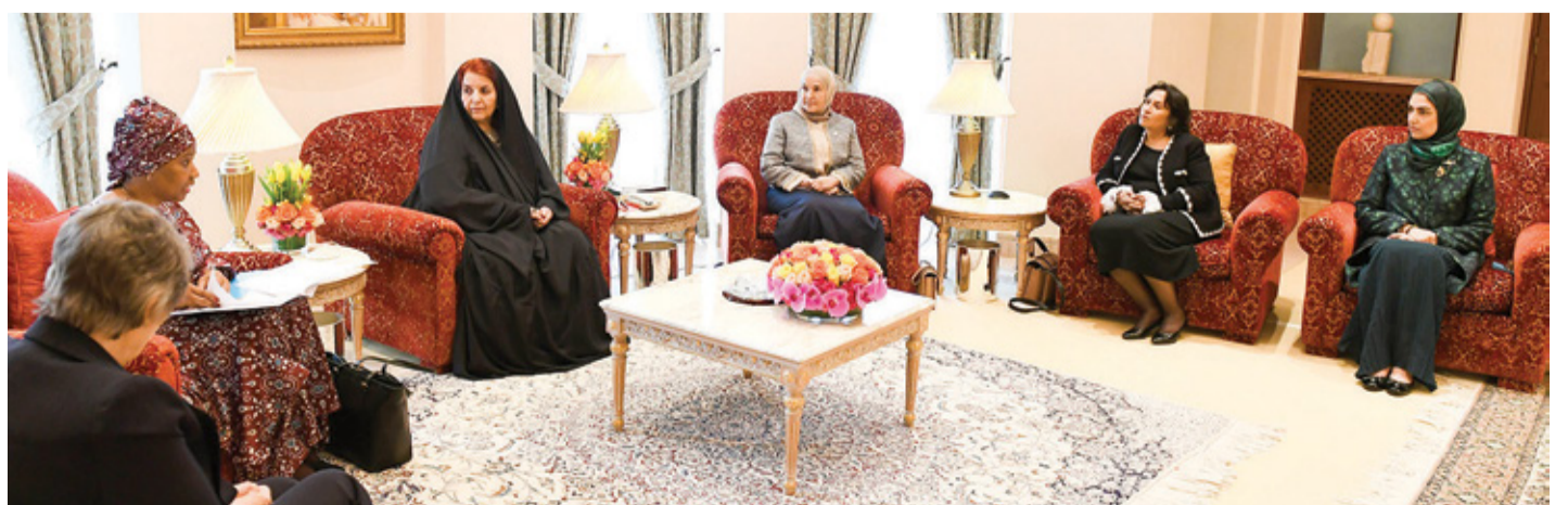
HRH Princess Sabeeka holds talk with members of award jury panel.