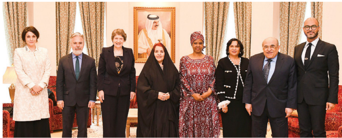
HRH Princess Sabeeka with award jury panel.

HRH Princess Sabeeka expressed her thanks and appreciation to UN Women for the fruitful cooperation in declaring this award as well as activating its intended objectives. Her Royal Highness also praised efforts endorsed by the jury and team