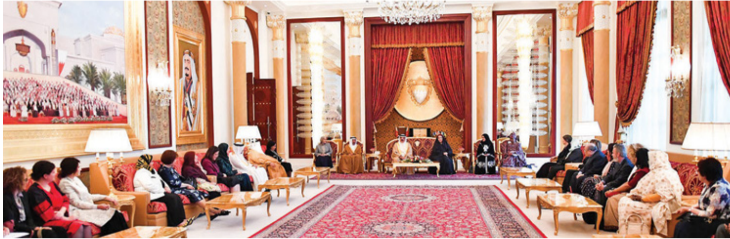
His Majesty, HRH Princess Sabeeka hold talks with award jury panel.

HM the King stressed promoting the Bahraini women's rights to continue their contributions