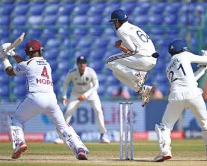
West Indies’ Shai Hope plays a shot as India’s Yashasvi Jaiswal leaps in air

Earlier, Justin Greaves with an unbeaten 50 and Jayden Seales (32) put on 79 runs for