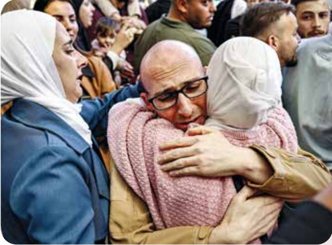
One of the Palestinian prisoners, who was released in a prisoner-hostage swap and ceasefire deal between Israel and Hamas, is embraced by a woman