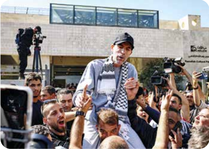
One of the Palestinian prisoners, who was released in a prisoner-hostage swap and ceasefire deal between Israel and Hamas, is carried on shoulders