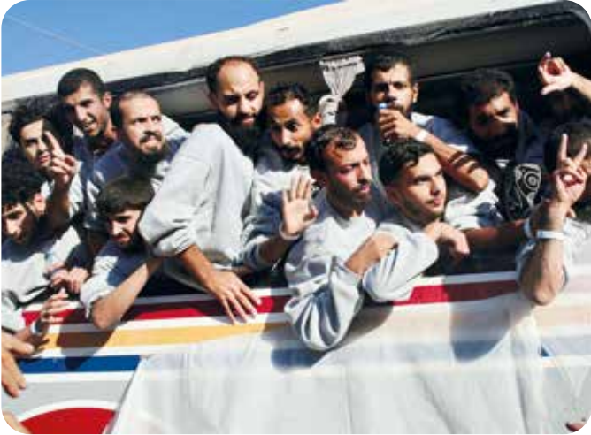
Buses carrying Palestinians released from Israeli prisons