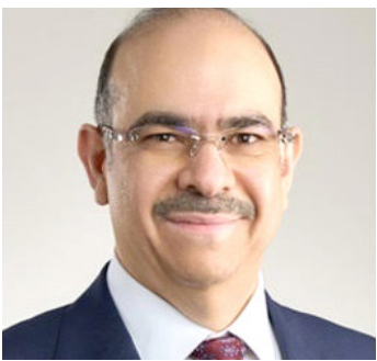
H.E. Yousif bin Abdulhussain Khalaf

dulhussain Khalaf, Minister of Legal Affairs and Acting Minister of Labour, announced that seven companies have joined the latest hiring wave, reflecting growing cooperation between the ministry, the Bahrain Chamber of Commerce and Industry, and the private sector. Sector-wide expansion The companies adding new openings include Beyon with 150