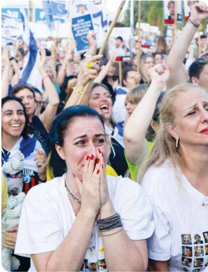
A woman reacts as people celebrate at Hostage Square in Tel Aviv as news came out that a Red Cross convoy is on its way to pick up a second group of Israeli hostages to be freed by Hamas

Nazi Germany announces its withdrawal from the League of Nations