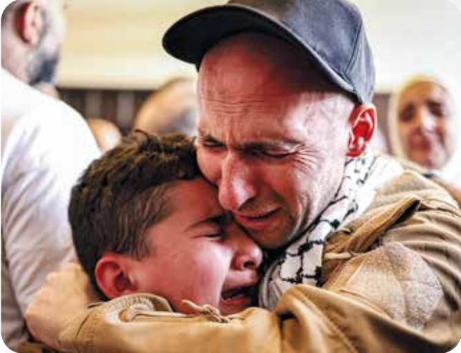
One of the Palestinian prisoners, who was released in a prisoner-hostage swap and ceasefire deal between Israel and Hamas, embraces a boy upon arrival