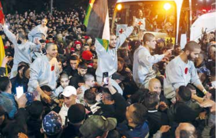
A crowd welcomes Palestinians formerly jailed by Israel as they arrive in a Red Cross convoy to Ramallah in the occupied West Bank