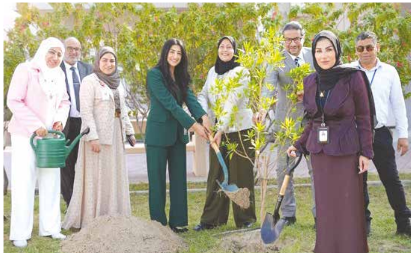
The Government Hospitals Administration proudly joins National Tree Week, planting trees at the Salmaniya Medical Complex. In line with directives from HRH the Crown Prince and Prime Minister, this vital initiative supports Bahrain's national plan to plant 3.6 million trees by 2035 as part of the vision to achieve carbon neutrality by 2060