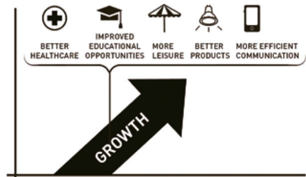
Economic growth is more than just money. It also includes factors such as education, research, healthcare, quality of life and job opportunities