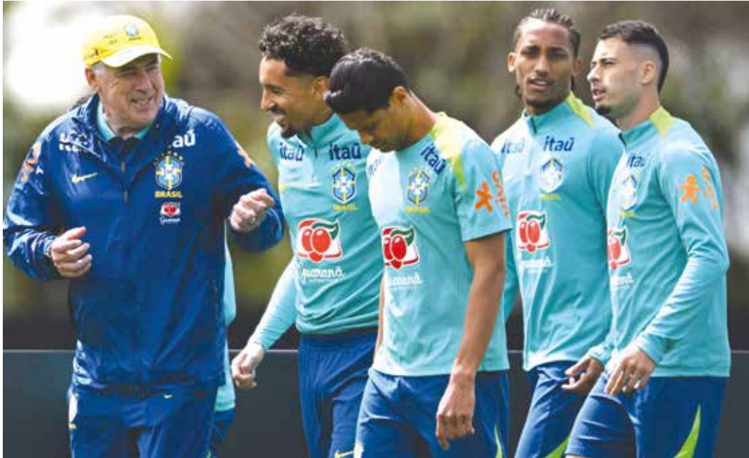
Brazil's Italian head coach Carlo Ancelotti talks with his players during a training season

No country has ever won the World Cup with a foreign-born coach but Carlo Ancelotti said yesterday that there was “always a first time” as he eyes glory with Brazil. The Italian became Brazil's first overseas coach in six decades when he took over in May and he helped the five-times champions punch their ticket for next summer's World Cup. Brazil face Japan in a friendly in Tokyo on Tuesday, fresh from a 5-0 hammering of South Korea in Seoul last week. Ancelotti said he is aiming to create history for himself and his team at the World Cup in the United States, Canada and Mexico. “My goal is to give my best for the Brazil national team, to try