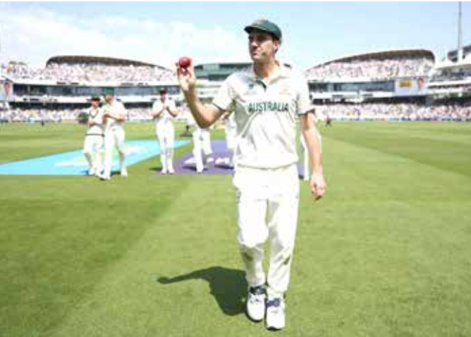
Pat Cummins reacts after a session (file photo) | Sydney

Injured Australia captain Pat Cummins said yesterday that he was “probably less likely than likely” to be fit for the first Ashes Test next month, but was still clinging to a shred of hope. Pace spearhead Cummins has not played since picking up a lower back injury in a Test match against the West Indies in July. Cummins admitted time was running out to get his body ready for the opening Ashes Test beginning in Perth on November 21. “I'd say probably less likely than likely, but still got a bit of time,” Cummins told reporters, adding that he felt a “bit stiff”. Cummins said he was still two weeks away from bowling again in the nets and then it would take time to rebuild