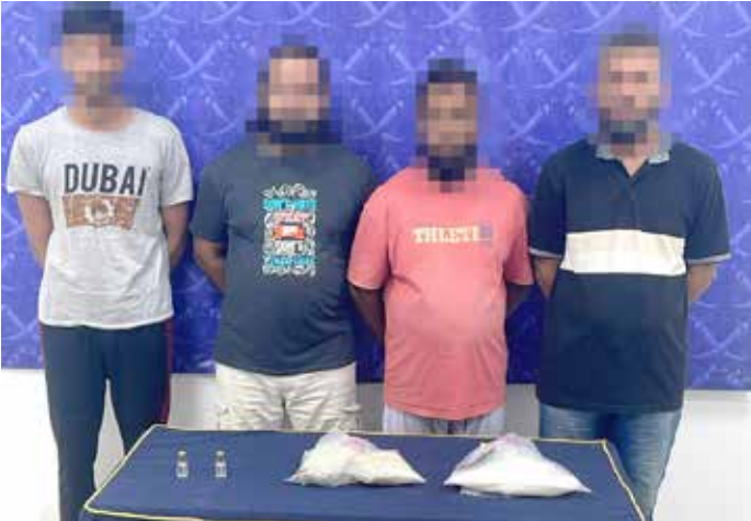
Suspects with the seized evidence

Ten individuals of various nationalities, aged between 21 and 42, were arrested in five separate cases for possession of approximately 12 kilograms of narcotics, with an estimated street value exceeding BD176,000, the Ministry of Interior confirmed. The arrests form part of ongoing security efforts by the Anti-Narcotics Department of the General Department of Criminal Investigation and Forensic Science, conducted in cooperation with Customs Affairs, aimed at protecting society from the dangers of drug abuse and trafficking. According to authorities, following receipt of actionable intelligence, targeted searches, investigations, and information-gathering operations were launched, leading to the identification and apprehension of the suspects along with the narcotics in their possession. The General Department of