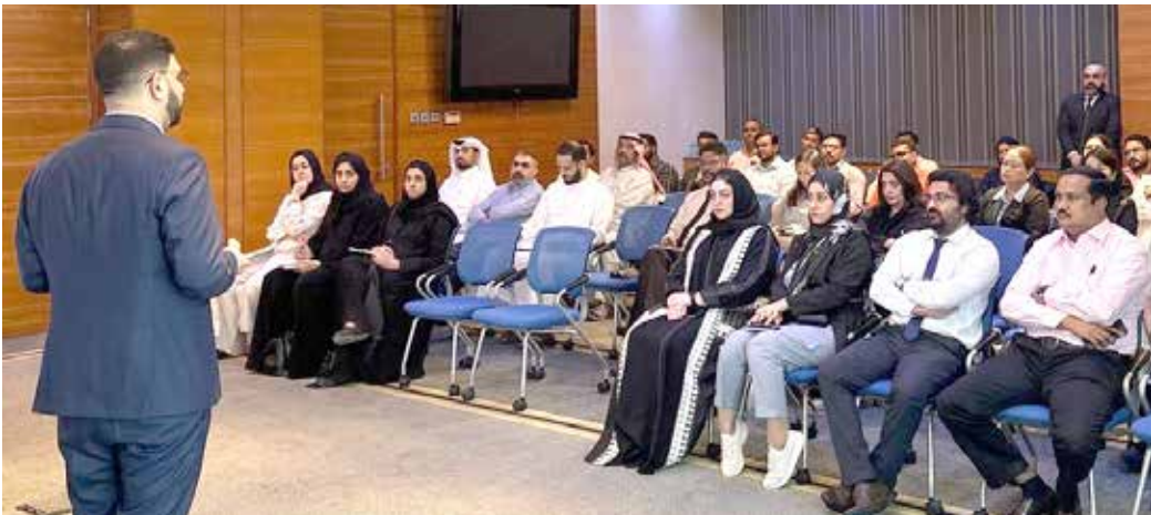
Training workshops in progress