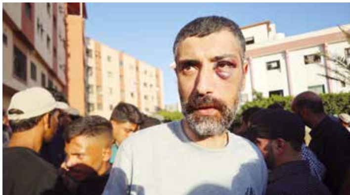
A Palestinian released from Israeli prisons under a Gaza ceasefire and hostage exchange deal with Palestinian factions, arrives at the Nasser hospital in Khan Yunis in the southern Gaza Strip In return, Israel released 1,968 Palestinians, the prison service said.

The bodies of four Israeli hostages who died in captivity in Gaza were handed over to the Red Cross by Hamas yesterday. “The Red Cross has received two coffins of deceased hostages and are on their way to IDF and ISA forces in the Gaza Strip, where the two additional coffins of deceased hostages, that were received earlier, are located,” the military said. Earlier yesterday, Hamas freed all 20 surviving hostages it had been holding since October 7, 2023, as part of a ceasefire agreement brokered by US President Donald Trump.