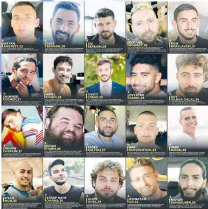
Israeli army identifies the twenty released Israeli hostages

ing 20 hostages had returned to the country, with a series of posts on X that read: "Welcome home". The Hostages and Missing Families Forum, the main organisation representing their relatives, had called on people to gather at the site with the yellow ribbons.