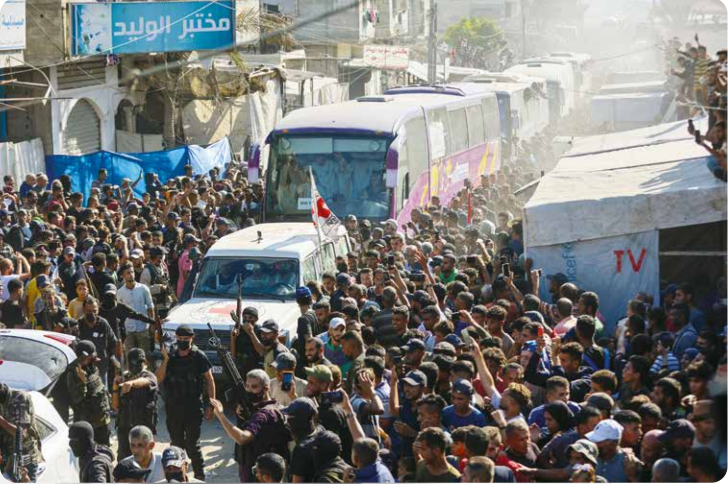
Buses carrying Palestinians released from Israeli prisons under a Gaza ceasefire and hostage exchange deal with Palestinian factions, arrive outside the Nasser hospital in Khan Yunis in the southern Gaza Strip