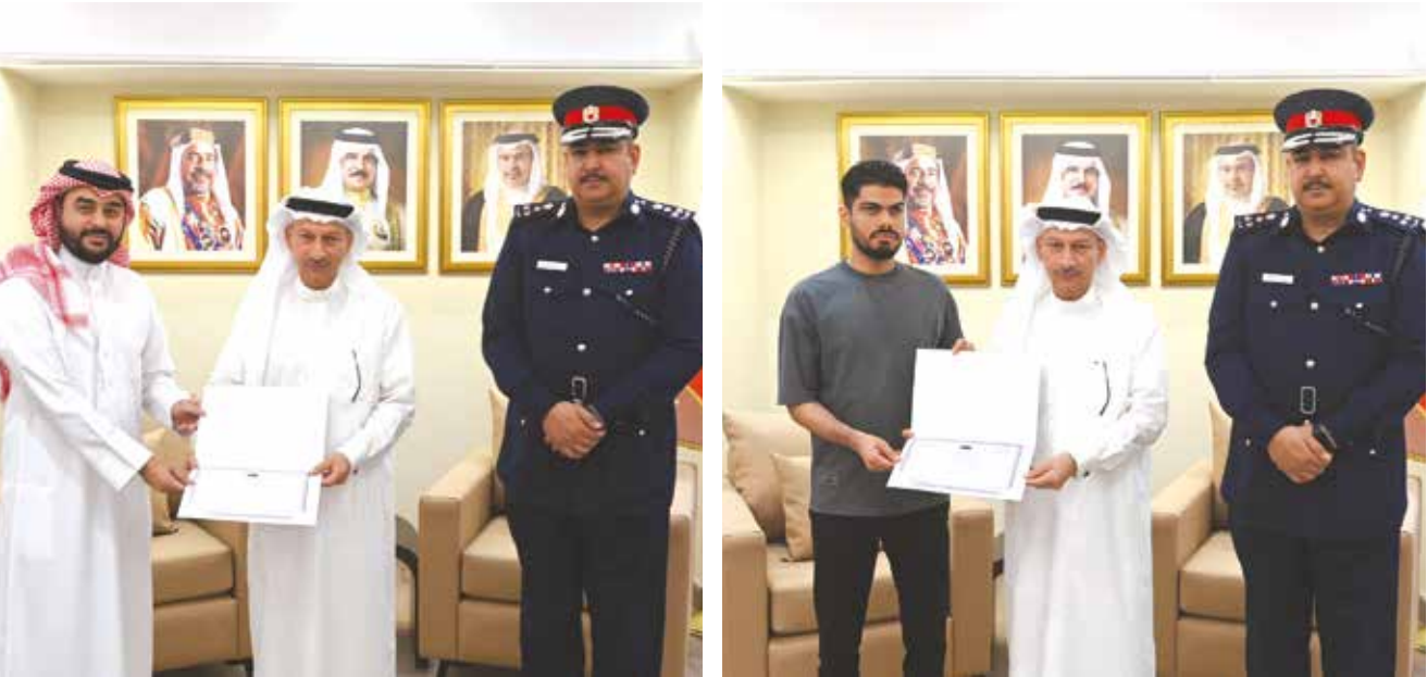
H.E. Hassan Abdullah Al Madani, Governor of the Northern Governorate, honoured two citizens in appreciation of their distinguished cooperation with security services. H.E. the Governor emphasized that active community partnership remains a fundamental pillar of security strategy, guaranteeing stability and reassurance for all residents