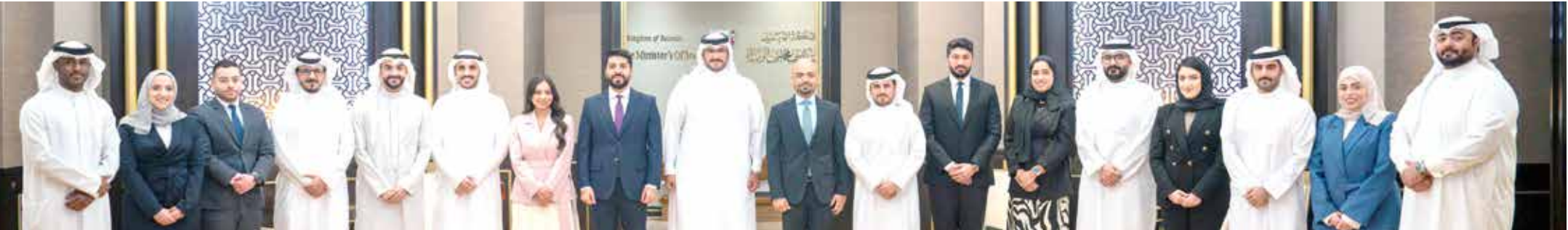
His Highness Shaikh Isa bin Salman bin Hamad Al Khalifa, Minister of the Prime Minister's Court, emphasised that investing in Bahraini professionals is vital to advancing sustainable development and supporting the delivery of quality government services. HH Shaikh Isa was speaking as he met yesterday with the tenth intake of the Prime Minister's Fellowship Program at Gudaibiya Palace. He commended the dedication, professionalism, and sense of national responsibility demonstrated by the Fellows, commending their commitment to excellence in serving the Kingdom. His Highness expressed his appreciation to all those involved in the continued success of the Prime Minister's Fellowship Program, noting its role in preparing future leaders and enhancing governmental performance.