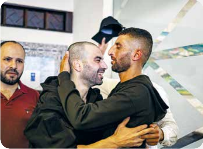
One (L) of the Palestinian prisoners, who was released in a prisoner-hostage swap and ceasefire deal between Israel and Hamas, is kissed by his brother