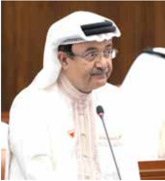
MP Mohammed Janahi

MPs want a short pause on new licences for delivery motorbikes while a full set of rules is drawn up, citing rising deaths and heavier traffic. The move is led by MP Mohammed Janahi, joined by Mohammed Al Maarifi, Abdulnabi Salman, Eman Shuwaiter and Hesham Al Ashiri. They have lodged a non-binding proposal asking the government to stop issuing permits for new delivery bikes until a complete framework is in place. In their note, the sponsors say the delivery market is saturated in the number of bikes on the road, which has hurt traffic flow. They add that rapid growth has brought in riders and firms