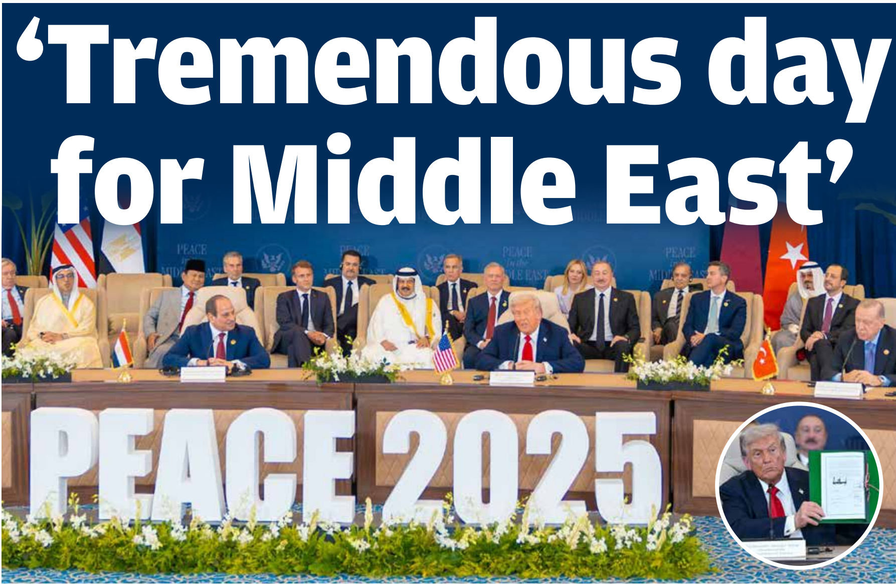
HM the King witnesses the signing of the peace agreement

His Majesty commended President Trump's role in achieving the peace accord and ending the hostilities in Gaza, while President Trump praised HM the King's efforts in fostering dialogue and strengthening the longstanding friendship between Bahrain and the United States.