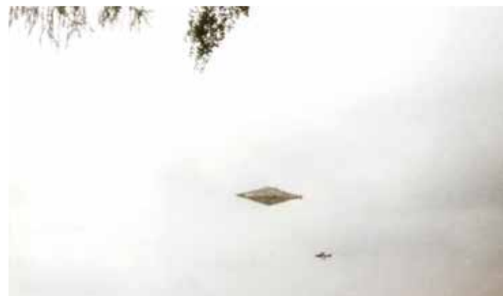
This photograph, taken by two young chefs on August 4, 1990, has been hidden from view for more than 30 years

Minutes later, they heard the scream of a jet aircraft going north: In 1990, RAF Leuchars in Fife had two squadrons of Tornado fighters on 24-hour