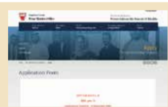
To apply, log on to www.pmo.gov.bh

The PM's Fellowship Programme was launched in 2015 to help mentor and prepare exceptional young Bahrainis from various government entities for a career in public service leadership.