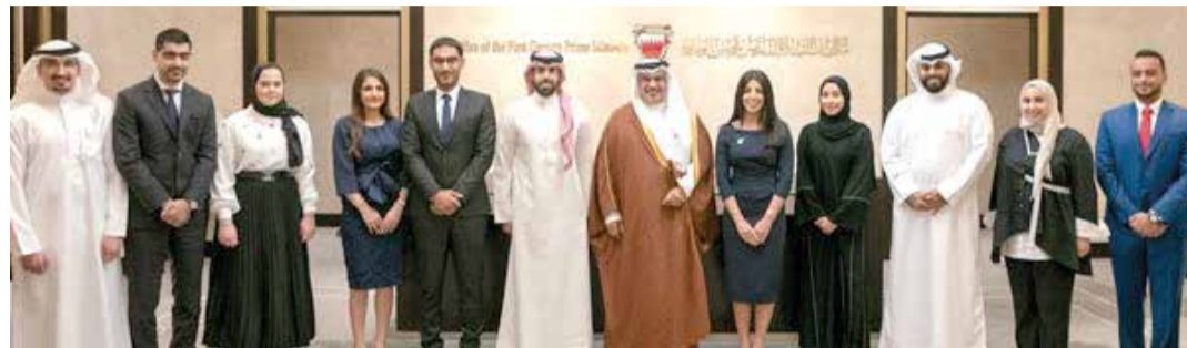
HRH the Crown and Prime Minister with Fellowship recipients (file)

Selected individuals will spend a year working as full-time research fellows in the Prime Minister's Office, benefiting from advanced training in writing skills, research methods and policy analysis, both in-house and through the Bahrain Institute of Public Ad-