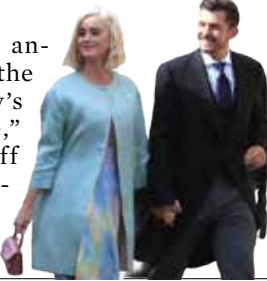
Orlando Bloom and Katy Perry

Now, during a virtual visit on “The Tonight Show,” the “Carnival Row” star gushed about his excitement to welcome his second child. “I’m so excited to have a little daddy’s girl,” the actor said. “I hope she’s going to love me as much as I’m going to love her.” Bloom also said he’s looking forward to “that love of your life feeling.”