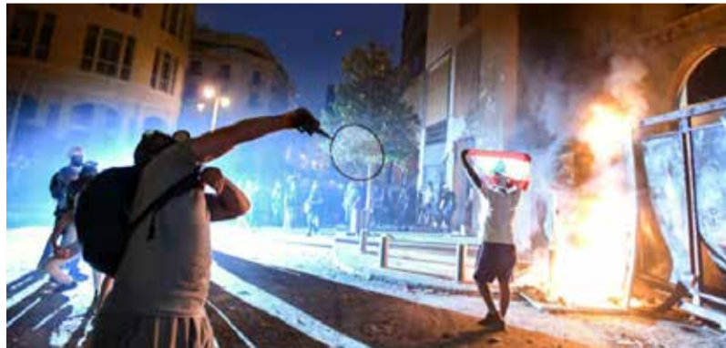
A Lebanese protester uses a tennis racket to throw projectiles during clashes with security forces in downtown Beirut