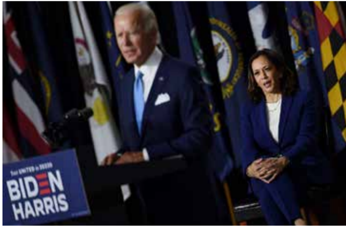
Kamala Harris listens to Joe Biden speak during their first press conference together in Wilmington, Delaware

Democratic presidential hopeful Joe Biden and his running mate Kamala Harris will put the coronavirus pandemic front and center in their campaign, targeting Donald Trump's response to the health and economic crises ahead of November's election.