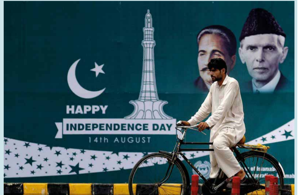
A cyclist waits to cross a road next to a Happy Independence Day billboard with the pictures of founder leader Muhammad Ali Jinnah and national poet Allama Muhammad Iqbal in Islamabad, Pakistan.