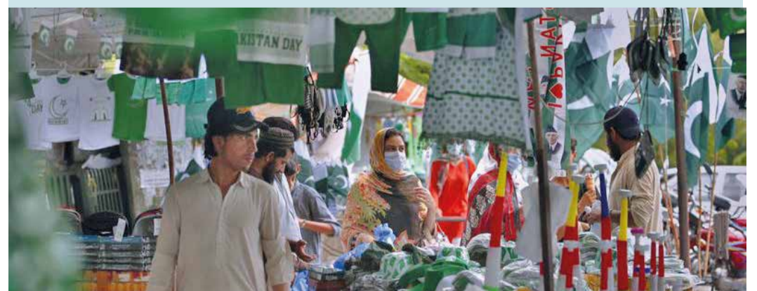
Citizens are getting ready to celebrate Independence Day with zeal and zest. The most enthusiastic are children who are busy collecting stickers, badges and also beautifying their bicycles with unique stickers inscribed with messages of Independence Day. Above, a woman shop national flags, badges and masks and other stuff at a market ahead of Pakistan Independence Day celebration, in Islamabad.

P. O. Box 118 Manama, Kingdom of Bahrain, Tel: 00973 32007700 Email: pakistanclubbahrain@gmail.com | Web: pakistanclub.org