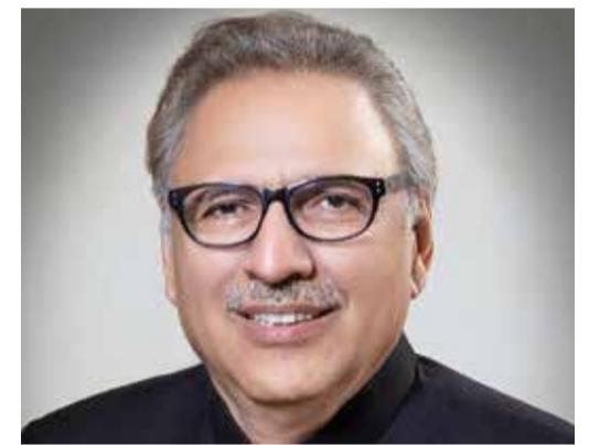
Pakistan President Dr. Arif Alvi

Dr. Arif Alvi, President of the Islamic Republic of Pakistan, has paid tribute to 'Father of the Nation' Quaid-e-Azam Muhammad Ali Jinnah on his untiring efforts for an independent homeland "Pakistan" for the Muslims of sub-continent. In his message on the occasion of the 74th Independence Day Dr Arif Alvi extended his heartiest felicitations to the fellow countrymen. 'This day reminds us of the immense sacrifices rendered by our forefathers, under the dynamic leadership of Quaid-e-Azam Muhammad Ali Jinnah. The day is an occasion to reaffirm our resolve to live up to the ideals of our founding fathers and pay homage to the heroic struggle of all workers of Pakistan Movement', he said.