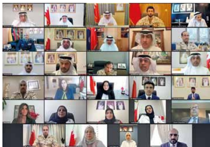
HRH Prince Salman speaks during an online meeting yesterday

His Royal Highness Prince Salman bin Hamad Al Khalifa, the Crown Prince and Prime Minister, yesterday made a fresh appeal to everyone who calls the Kingdom "home" to continue working together to defeat the coronavirus (COVID-19). Describing it as a national responsibility, HRH Prince Salman noted that collective community action continues to be the foundation of success in the fight against the deadly virus. His Royal Highness was speaking during his virtual meeting yesterday with senior