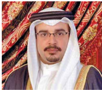
HRH Prince Salman