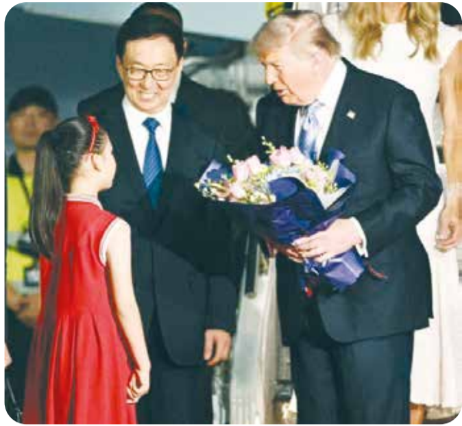
Trump receives flowers upon arrival

David Ben-Gurion declares Israel independent from British administration, Golda Meir one of the signatories