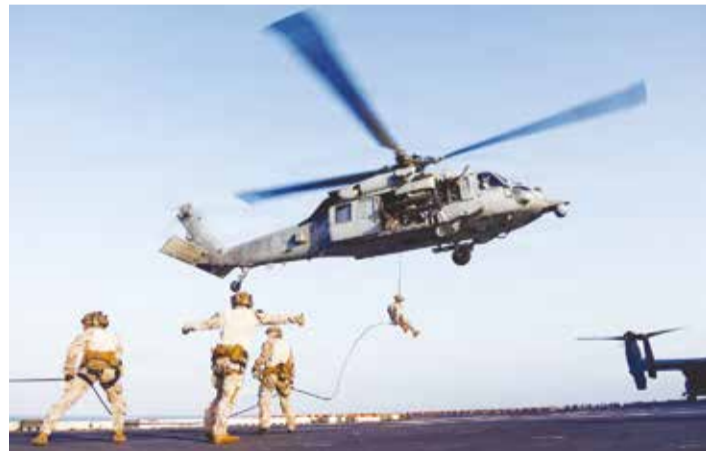
US Marines with Maritime Raid Force rappelling out of an MH-60S Sea Hawk, assigned to Helicopter Sea Combat Squadron 25, during helicopter and roping sustainment training aboard the forward-deployed amphibious assault ship USS Tripoli at sea

The agency now expects global demand to shrink by 2.4 million barrels per day (mb/d) in the second quarter, down from its forecast of a 3.5 mb/d before