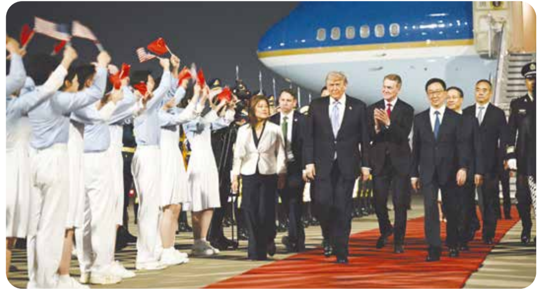
US President Donald Trump (C), US Ambassador To China David Perdue (center-R) escorted by China's Vice President Han Zheng (R) are greeted by Chinese youth upon arriving at Beijing Capital Airport in Beijing