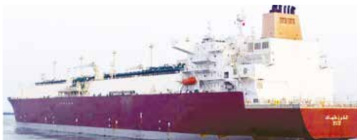
Qatari LNG tanker MV Al Kharaitiyat arriving at Engro Elengy Terminal (EETL) in Karachi.

Military says control over Hormuz to bring significant economic revenues