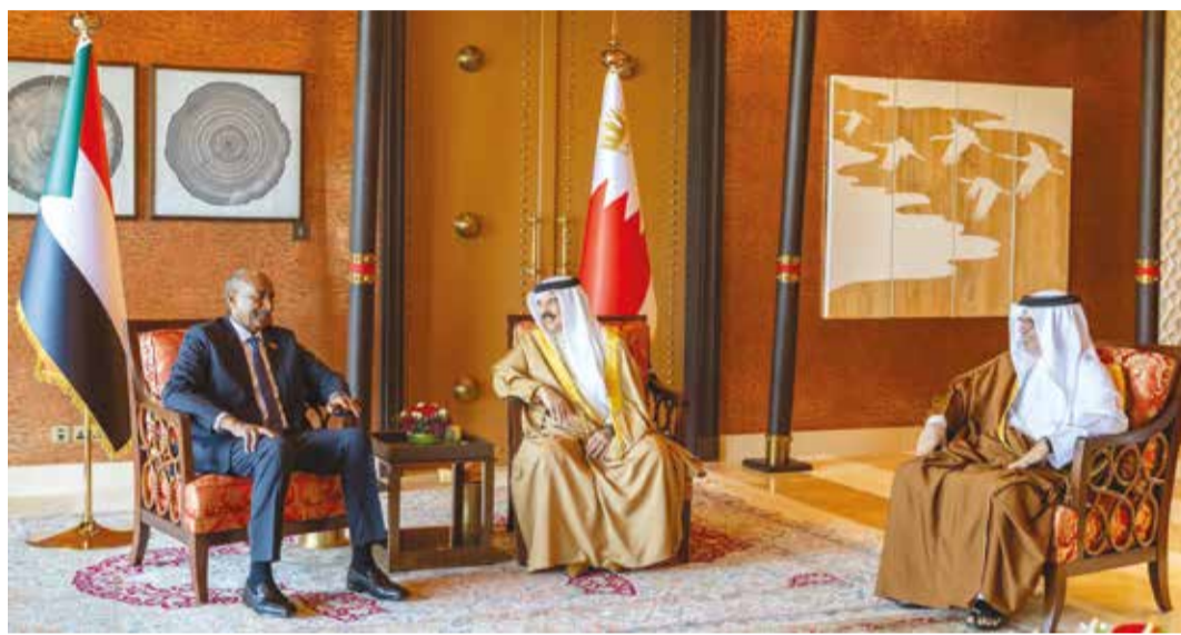
HM the King, in the presence of HRH Prince Salman, holds talks with General Abdel Fattah Al Burhan

mitment to further developing ties in a manner that serves mutual interests and supports the