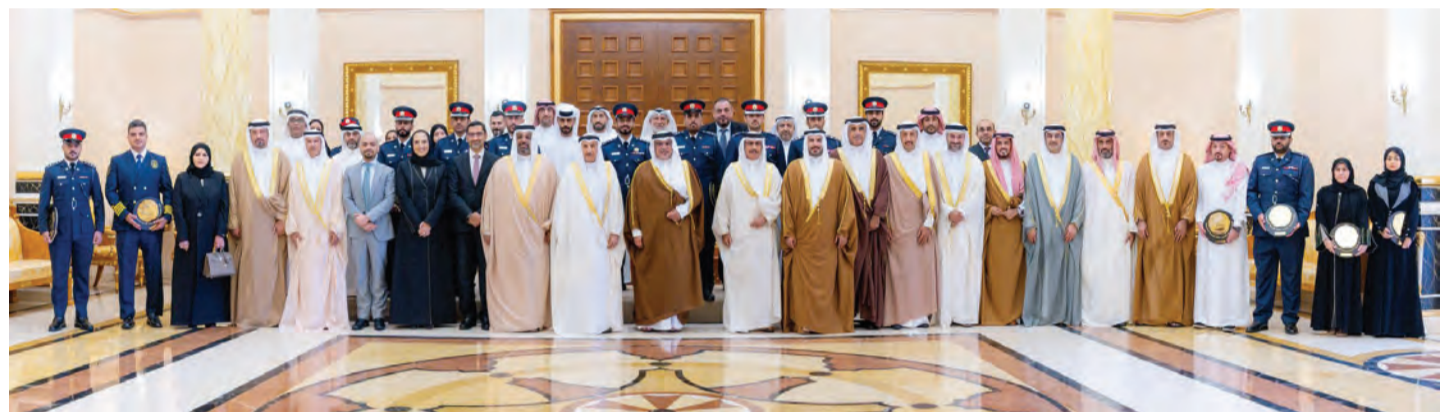
HRH Prince Salman with senior government officials and recipients of the awards