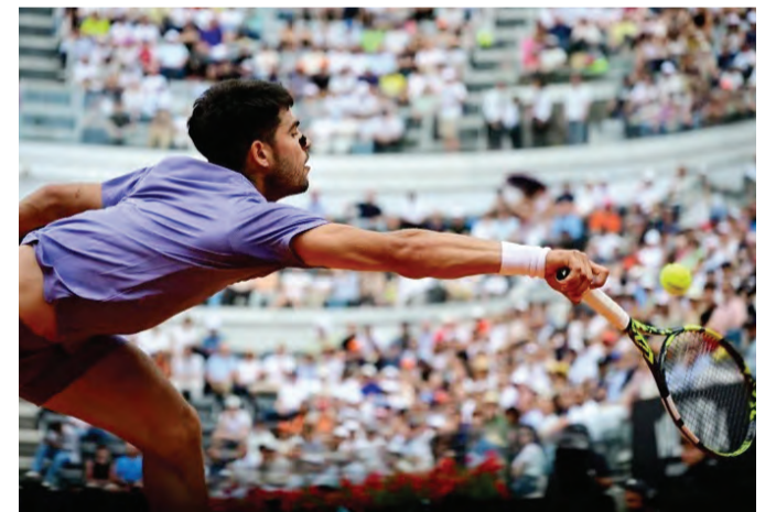
Carlos Alcaraz in action