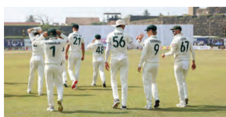
Australia's players arrive for a match (file photo)

Cummins (ankle) and Hazlewood (hip and calf) missed Australia's most recent Test series in Sri Lanka because of injury but both have successfully returned to ac-