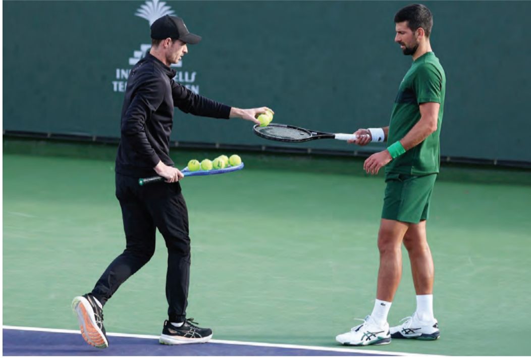
Novak Djokovic of Serbia and his coach Andy Murray working on his serve during a practice session (file photo)

week before the Serb, thanked his former adversary for the chance to work with him.