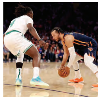
Jalen Brunson of the New York Knicks dribbles against Jrue Holiday of the Boston Celtics

A potentially fatal defeat for Boston was exacerbated by a serious injury to forward Jayson Tatum, who looked dis-