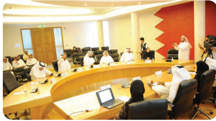
Muharraq Municipal Council meeting in progress

lost. Al Qallaf also addressed reports that demolition work on derelict heritage-listed homes had been halted.