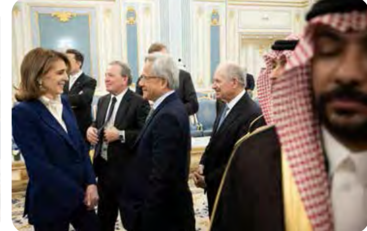
Alphabet chief investment officer Ruth Porat (L) and Nvidia CEO Jensen Huang (C) wait to meet the Saudi Crown Prince at the Royal Court in Riyadh