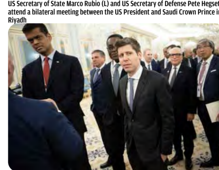
OpenAI CEO Sam Altman (C) and ImmunityBio Executive Chairman Patrick Soon-Shiong (R) wait to meet the Saudi Crown Prince