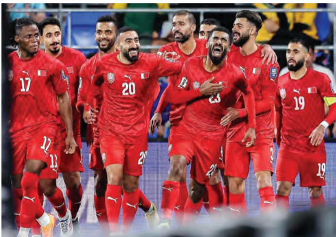
Bahrain's players celebrate during a match (file photo)

New York, which will host the final at MetLife Stadium, offers packages starting from $25,800 USD (approx. 9,710 BHD) up to $73,200 USD (approx. 27,530 BHD). Los Angeles,