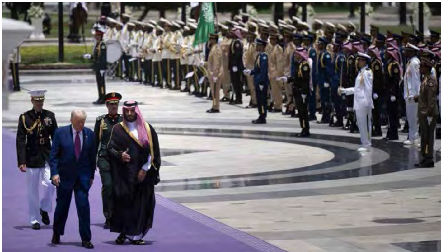
Saudi Crown Prince Mohammed Bin Salman and US President Donald Trump review the honour guard at the Royal Court in Riyadh

● The US leader will head later in the week to Qatar and the United Arab Emirates