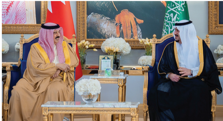
HM the King is welcomed by HRH Prince Mohammed bin Abdulrahman bin Abdulaziz Al Saud upon arrival