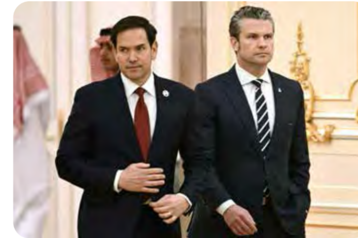
US Secretary of State Marco Rubio (L) and US Secretary of Defense Pete Hegseth attend a bilateral meeting between the US President and Saudi Crown Prince in Riyadh