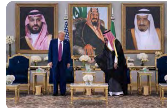
Saudi Crown Prince Mohammed bin Salman (R) meets with US President Donald Trump in Riyadh

Disclaimer: (Views expressed by columnists are personal and need not necessarily reflect our editorial stance)