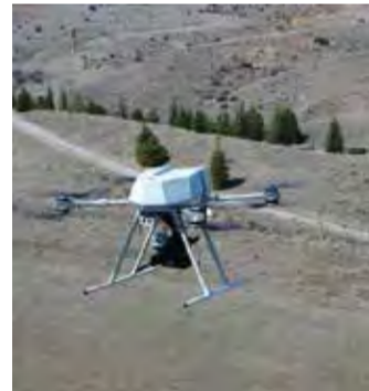
gather sensitive military intelligence," a senior Indian defense official said on condition of anonymity. "The scale and coordination of the drone intrusions mark a significant escalation."

President Erdoğan's visible support for Pakistan—especially amid ongoing tensions in South Asia—has already stirred debate among global observers. The latest incident will likely amplify calls for greater accountability and transparency in international arms transfers.