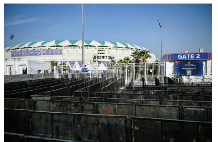
A view shows empty premises of the Ekana Cricket Stadium in Lucknow