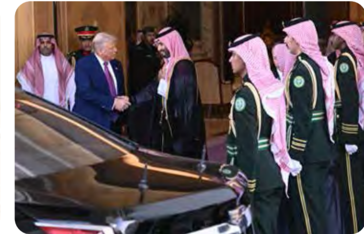
Crown Prince Mohammed bin Salman (C) greets US President Donald Trump as he departs after a bilateral meeting in Riyadh