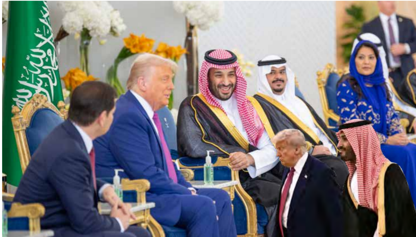
Saudi Crown Prince Mohammed bin Salman (C-R) meeting with US President Donald Trump (C-L) in Riyadh

Under imposing chandeliers, Trump welcomed a promise by Saudi Arabia's de facto ruler, Crown Prince Mohammed bin Salman, for $600 billion in investment and quipped that it should be $1 trillion. "We have the biggest business leaders in the world here today and they're going to walk away with a lot of cheques," Trump told the press. For "the United States, it's probably two million jobs that we're talking about," Trump said. The White House said that Saudi Arabia would buy nearly