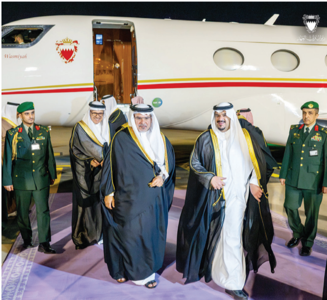
His Royal Highness Prince Salman bin Hamad Al Khalifa, the Crown Prince and Prime Minister, arrives in Saudi Arabia to attend the summit