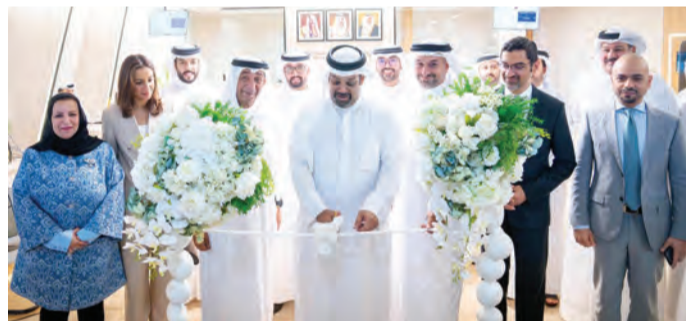
H.E. Shaikh Salman bin Khalifa Al Khalifa presides over the ribbon-cutting ceremony

This was emphasised by His Excellency Shaikh Salman bin Khalifa Al Khalifa, Minister of Finance and National Economy, who gave credit to the leadership of His Majesty King Hamad bin Isa Al Khalifa and the follow-up of His Royal Highness Prince Salman bin Hamad Al Khalifa, the Crown Prince and Prime Minister. Shaikh Salman also underscored the importance of strategic initiatives that attract investment and enhance