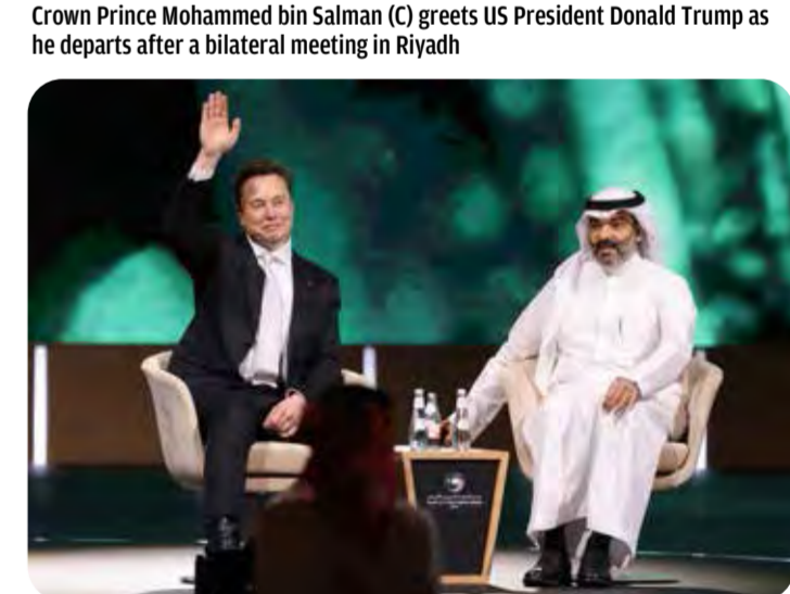
White House Senior Advisor, Tesla and SpaceX CEO Elon Musk waves as he attends a conference during the Saudi-US investment forum in Riyadh