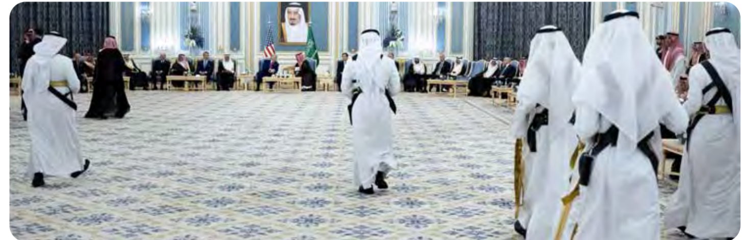
US President Donald Trump and Saudi Arabia's Crown Prince Mohammed Bin Salman talk before a coffee ceremony at the Royal Court in Riyadh