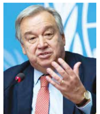
António Guterres, Secretary-General of the United Nations

It warned that ongoing maritime disruptions have left around 20,000 seafarers stranded on vessels, facing worsening conditions, while