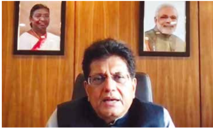
Commerce and industry minister Piyush Goyal.

As India is the world's sixth largest patent filer, the minister also said that the country's