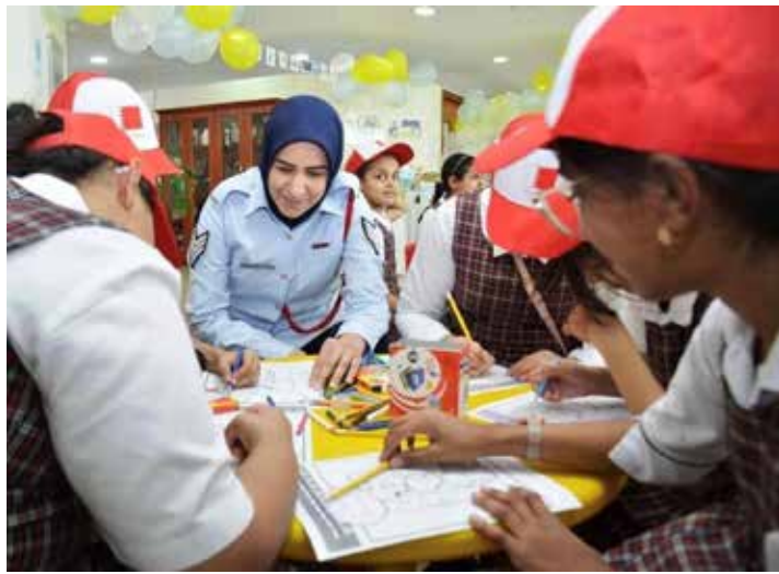
A policewoman interacting with students at school

The scope of community policing encompasses the knowledge of people's requirements, protecting families from disintegration, combating wrong behaviours, proper traffic management, tightening control over