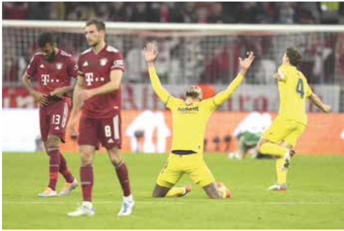
Villarreal players celebrate end of the match