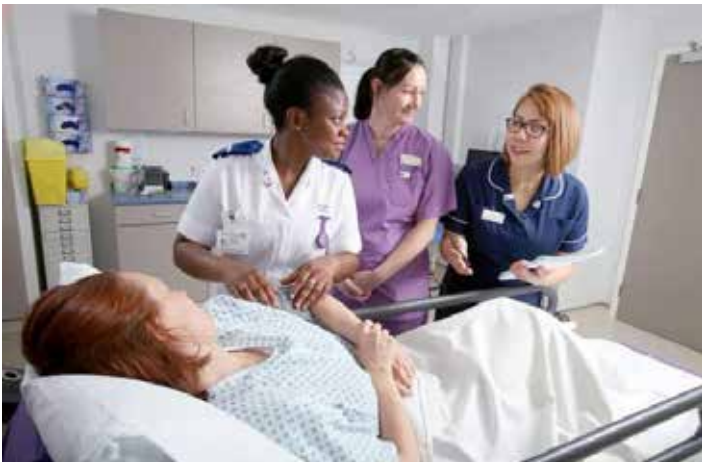
More nursing professionals were licensed during the pandemic period

quick to approve seven vaccines against Covid-19 with Bahrain becoming the first country in the world to approve all seven vaccines instantly.