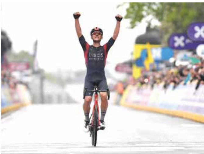
US' Magnus Sheffield of Ineos Grenadiers celebrates after winning the men's Brabantse Pijl