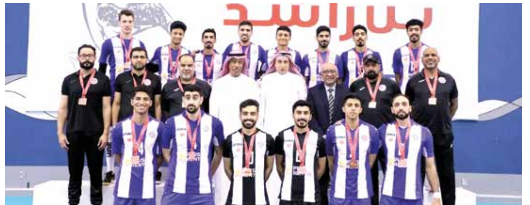
Dar Kulaib players with officials after receiving their bronze medals

After winning the first set, Dar Kulaib fell behind in the contest with Najma taking sets two and three. But the victors were able to bounce back in the