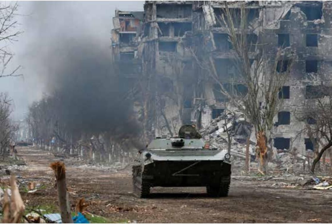
Service members of pro-Russian troops ride an armoured vehicle during fighting in Ukraine-Russia conflict near a plant of Azovstal Iron and Steel Works company in the southern port city of Mariupol, Ukraine

Ukraine’s general staff said Russian forces were proceeding with