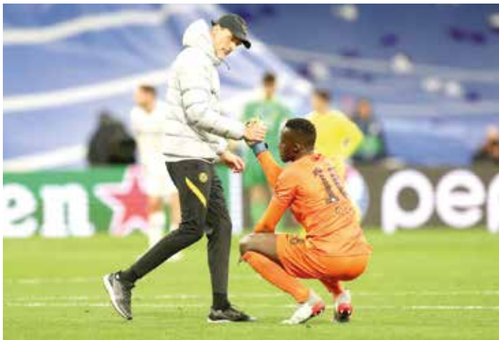
Chelsea manager Thomas Tuchel with Edouard Mendy after the match

Chelsea manager Thomas Tuchel said he was disappointed to see referee Szymon Marciniak "smiling and laughing" with Real Madrid coach Carlo Ancelotti after the Premier League side went out of the Champions League quarter-finals 5-4 on aggregate on Tuesday. Tuchel told a news conference he was disappointed that Marciniak was having "a good time with Carlo" after the final whistle. "When I wanted to go and say thank you, he was smiling and laughing with the opponent's coach," Tuchel added. "I think this is the very wrong