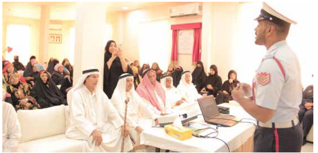
An awareness campaign in progress