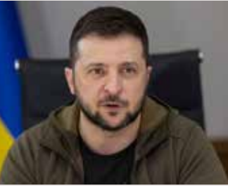
Ukraine’s President Volodymyr Zelenskyy

Bild reported that Zelenskyy had rejected Steinmeier’s plans