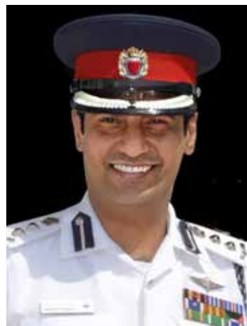
Colonel Abdulla Rashed