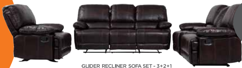
GLIDER RECLINER SOFA SET - 3+2+1