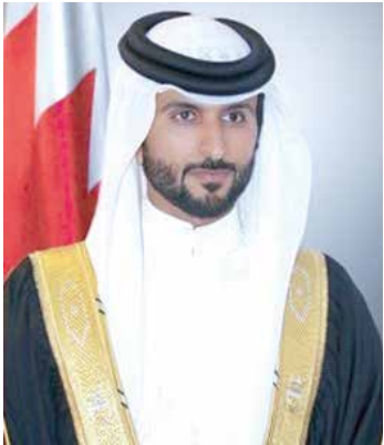
HH Shaikh Nasser

His Majesty the King's Representative for Humanitarian Work and Youth Affairs, His Highness Shaikh Nasser bin Hamad Al Khalifa, has praised the Royal Humanitarian Founda-