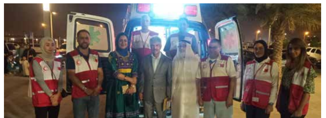
Organisers and participants in various educational training activities