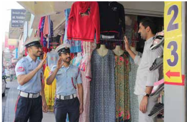
Policemen interact with a shopkeeper

commercial markets, ensuring safety of students at educational facilities, providing traffic