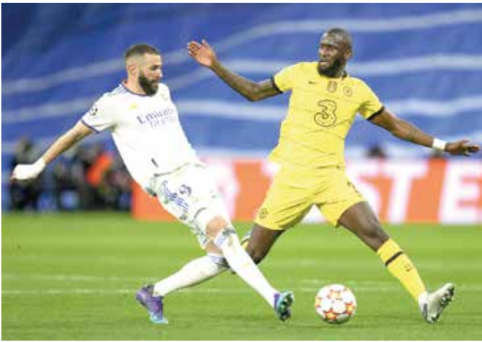
Real Madrid's Karim Benzema, left, and Chelsea's Antonio Rudiger fight for the ball

Real Madrid coach Carlo Ancelotti survived another breathtaking European night at the Bernabeu as his team saw off a stirring Chelsea fightback to book a place in the Champions League semi-finals despite a 3-2 defeat after extra time in the second leg. Their 5-4 aggregate win on Tuesday came five weeks after Real recovered from two goals behind in their tie against Paris St Germain to earn an epic 3-1 victory on the night as they knocked the visitors out 3-2 on aggregate in the last 16. "The more I suffer, the happier I am," Ancelotti told a news conference with a smile on Tuesday. "It was a lot of suffering, though. We were losing 2-0 (against Chelsea) but I believe we didn't deserve it, the team did well. We were not in a hurry to score, we didn't need it, but for me when they scored the second they didn't deserve it." Ancelotti praised his players for never giving up, even after going 3-0 behind with 15 minutes remaining before Rodrygo brought the tie level at 4-4 on