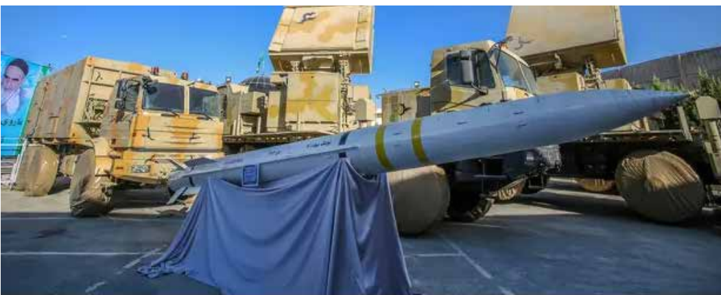
An Iran-made Bavar-373 air-defence missile system is understood to have been donated to Moscow by Tehran.

Using the weapons-trafficking underworld would signal a dramatic shift in Russian strategy, as Moscow is forced to lean on Iran, its military ally in Syria, following new sanctions triggered by the invasion of Ukraine.