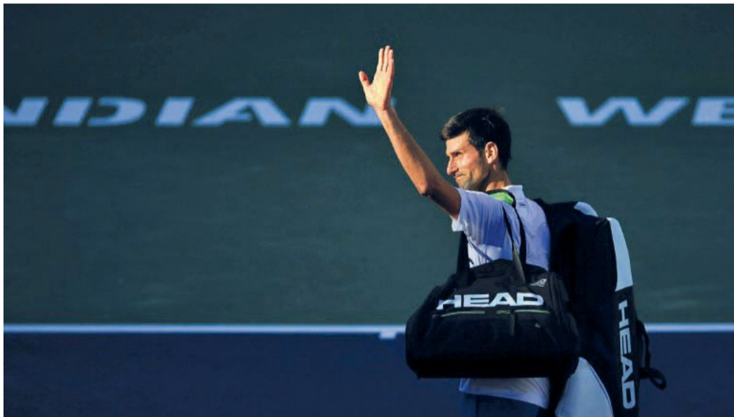
Novak Djokovic waves to the crowd after losing to Philipp Kohlschreiber of Germany

● Federer reached the last 16 after a 6-3, 6-4 victory over fellow Swiss Stan Wawrinka