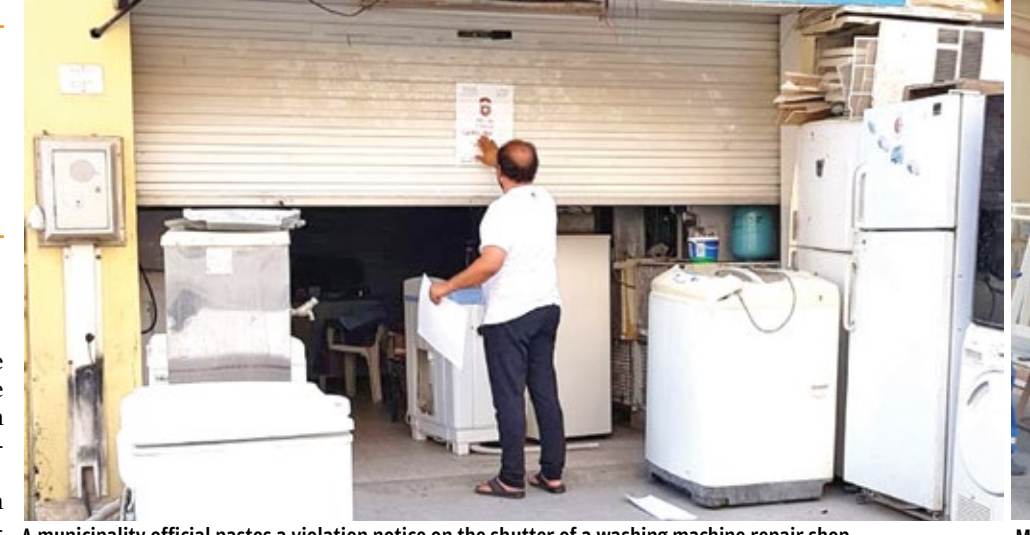
and Licensing Inspection De- A municipality official pastes a violation notice on the shutter of a washing machine repair shop.

olating businesses have been displeasure at the actions of the um products and tyre retreading