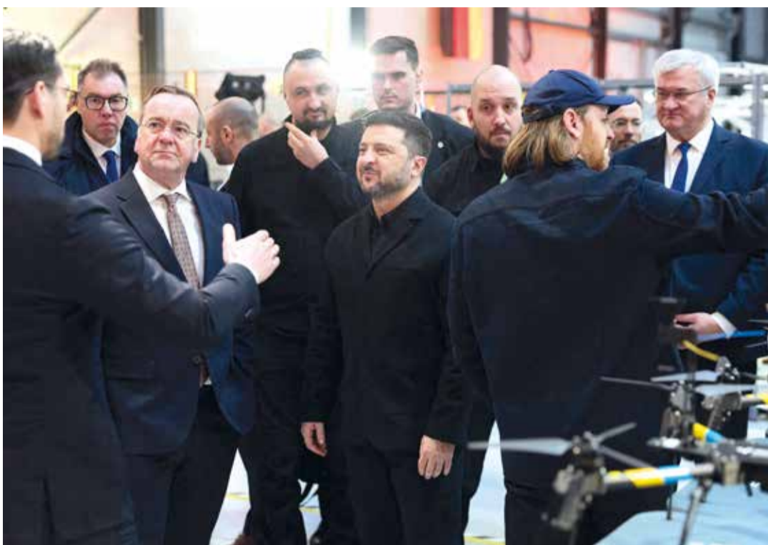
Ukraine's President Volodymyr Zelensky (C) and German Defence Minister Boris Pistorius (L) walking during a visit of the drone manufacturer Quantum Frontline Industries at the 62nd Munich Security Conference (MSC) in Munich

Peskov said Moscow's delegation to Geneva will be headed by Vladimir Medinsky, a hawkish ex-culture minister who led previous failed talks in Turkey, in a switch from the senior military officials who led two previous