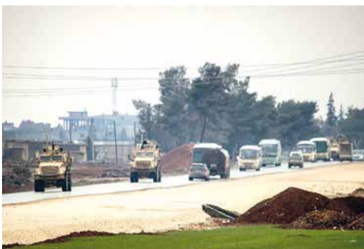
US military vehicles move along a road in a convoy transporting Islamic State group detainees being transferred to Iraq from Syria, on the outskirts of Qahtaniyah in Syria's northeastern Hasakah province

in 2014, committing massacres and forcing women and girls into sexual slavery.