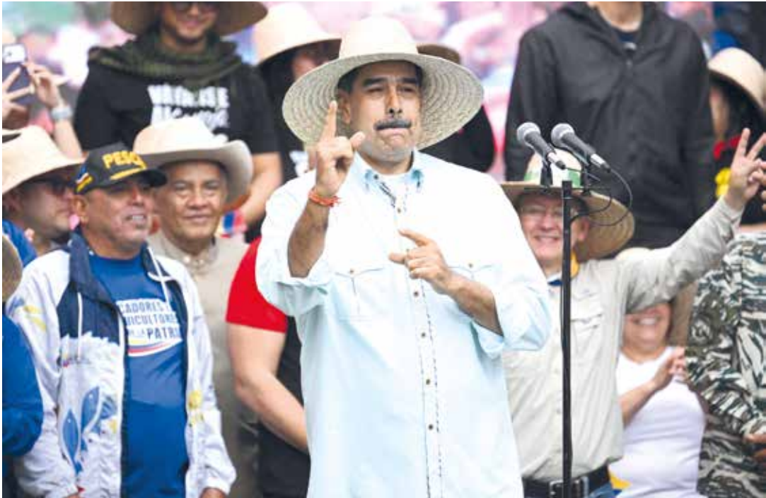
Venezuela’s President Nicolas Maduro gestures during a rally

In a dramatic raid this week that Homeland Security Secretary Kristi Noem said was aimed at Maduro’s “regime,” Washing-