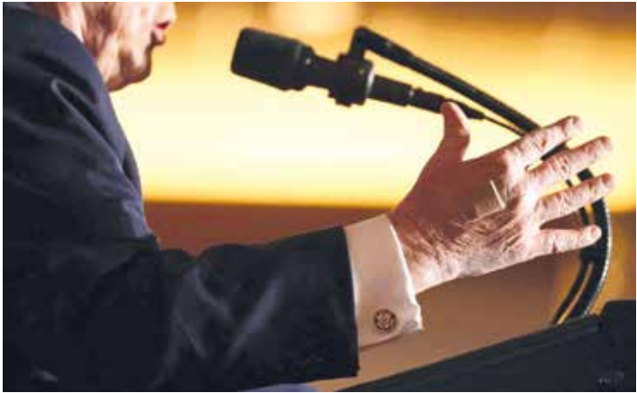
President Donald Trump sports a bandage on his right hand as he delivers remarks during an event