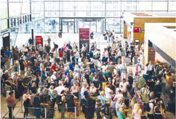
Passengers queue for check-in at Terminal 1 of Berlin Brandenburg BER Airport Willy-Brandt in Schoenefeld, southeast of Berlin

He also said Russia had sought to influence February’s parliamentary election, which was won by the conservatives of Chancellor Friedrich Merz,