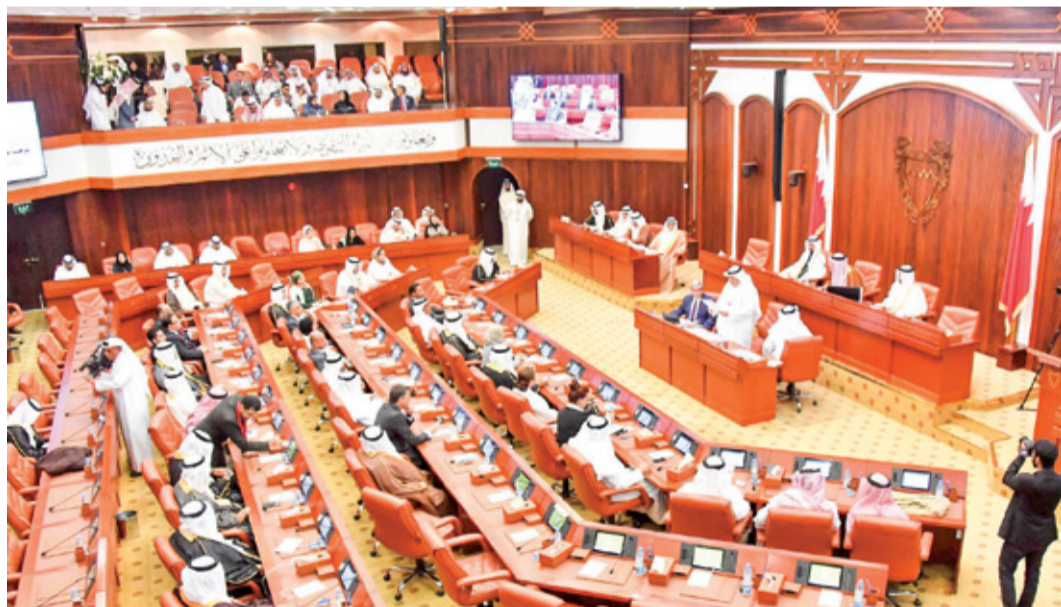
The House witnessed chaotic scenes before the chairwoman was elected.