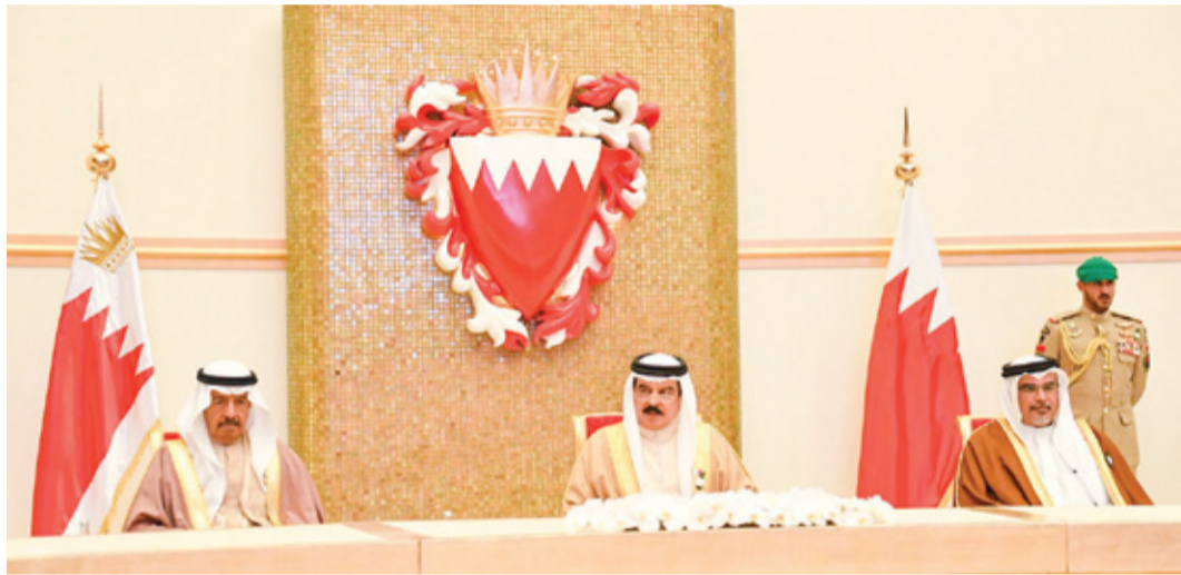
His Majesty with HRH the Premier and HRH the Crown Prince at the opening ceremony of the new legislative term.

Speaking on the occasion, His Majesty highlighted the need to take the nation forward by strengthening the bond be-