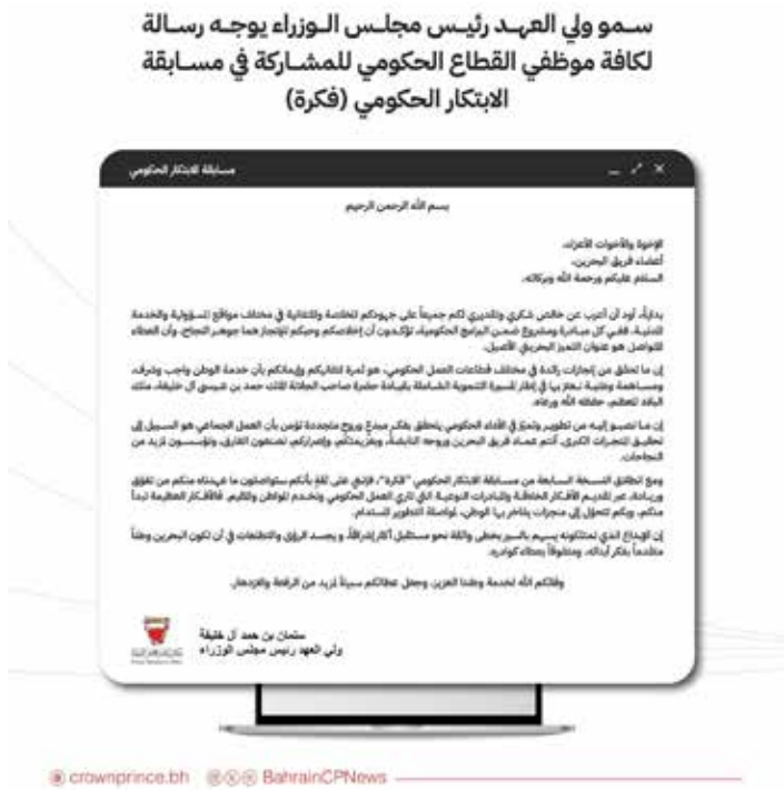
HRH Prince Salman's email recognises the tireless efforts and vital contributions of public employees

all public sector employees, HRH the Crown Prince and Prime Minister highlighted their tireless efforts and vital contributions across government workstreams in advancing the Kingdom's comprehensive development, led by His Majesty King Hamad bin Isa Al Khalifa. "The excellence and creativity