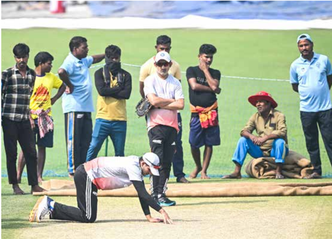
India's captain Shubman Gill inspects the pitch as coach Gautam Gambhir watches during a practice session

Shukri Conrad said having quality spinners, including Keshav Maharaj, Senuran Muthusamy and Simon Harmer, gave the team a boost.