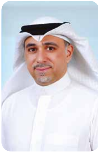
Maysan Al Maskati, Ithmaar Bank Chief Executive Officer

million reported for the same period in 2024. Total profit for the three-month period ended 30 September 2025 was BD3.75 million, compared to a net profit of BD3.64 million for the same period in 2024. The results also show a net profit attributable to equity holders for the nine-month period ended 30 September 2025 of BD3.95 million, compared to a net profit attributable to equity holders of BD8.92 million for the same period in 2024. The decrease is mainly due to reduced spreads in their overseas business resulting from the decreasing profit rate environment. Total profit for the nine-month period ended 30