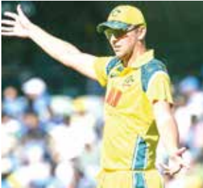
Josh Hazlewood | Sydney

Pace spearhead Josh Hazlewood was cleared to continue his preparations for the first Ashes Test against England after sending a scare through the Australian camp yesterday when he went for a hamstring scan. Hazlewood and reserve Test quick Sean Abbott both left the Sydney Cricket Ground during New South Wales’s Sheffield Shield clash with Victoria for assessments. While Hazlewood was given the all-clear, Abbott, named in Australia’s 15-man squad, was ruled out of the opening Test in Perth starting on November 21.