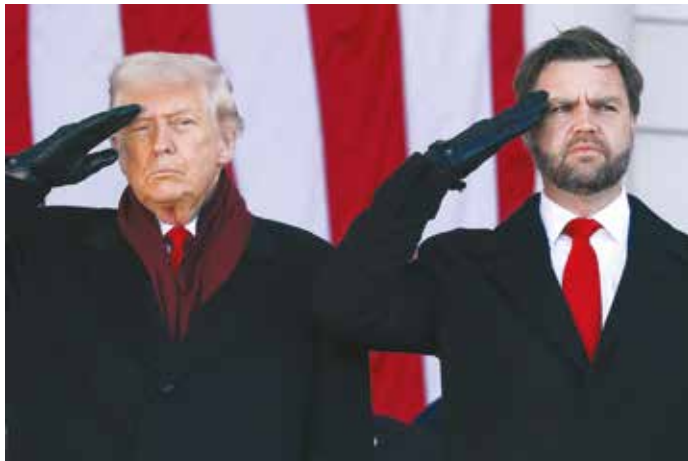
U.S. President Donald Trump and U.S. Vice President JD Vance salute during a ceremony at Memorial Amphitheater at Arlington National Cemetery to mark Veterans Day on November 11, 2025 in Arlington, Virginia.

In the letter, Trump says he is writing to Herzog at a "historic time, as we have, together, just secured peace that has been sought for at least 3,000 years."