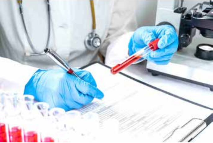
1. PAGE 3 LEAD (Image used for illustrative purposes only).jpg

Mandatory DNA tests for children of unknown parentage are before Parliament, with a central DNA database proposed to help match children to their biological parents and restore access to basic documents and services. The measure would require testing as soon as a child is found, under the supervision of state bodies, and the results would be compared with records of missing persons and related cases. The plan has been filed as a recommendatory proposal by MP Hassan Ebrahim and has been sent to the specialised committee. Views Relevant ministries are expected to submit their views before the Council considers the matter for a vote. Under the text, the Ministries of Interior, Social Development and Health would design and run a mandatory DNA-testing system for all cases involving children of unknown parentage and establish a central registry to store results. The proposal states that this may, in some instances, confirm identity and family ties and, in turn, unlock legal, social and human rights linked to name and status. Ebrahim said the move draws on constitutional guarantees that speak to justice, social care, health and equal opportunity. He said many children of unknown parentage spend their