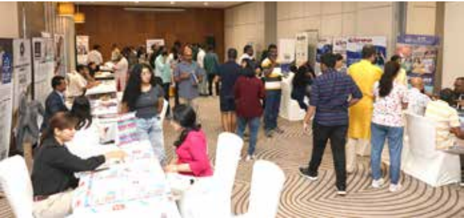
Students get direct access to information