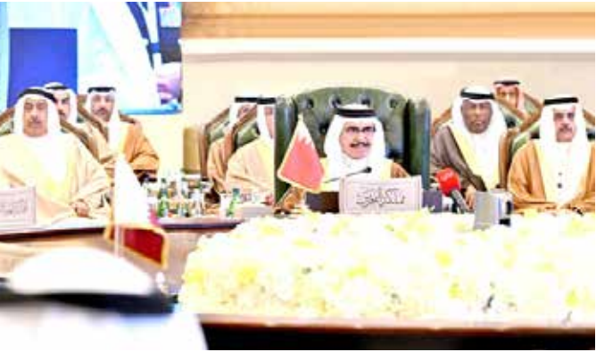
H.E. General Shaikh Rashid bin Abdullah Al Khalifa at the event Kuwait City