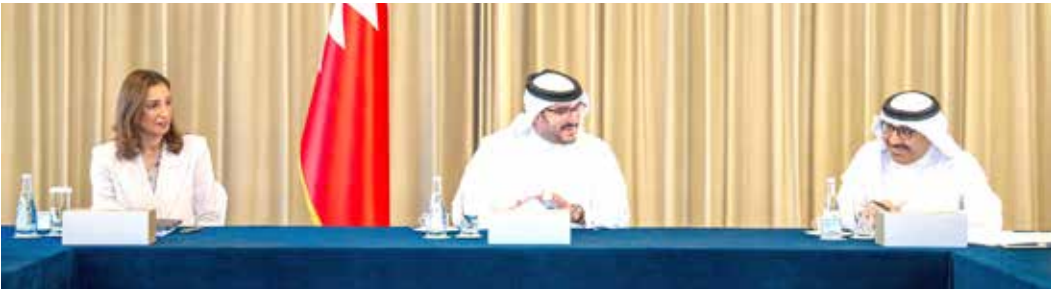
HH Shaikh Isa bin Salman bin Hamad Al Khalifa chairs the board meeting

Developing the education sector plays a vital role, serving as a cornerstone for building a society that drives Bahrain’s prosperity. This was emphasised by His Highness Shaikh Isa bin Salman bin Hamad Al Khalifa, Minister of the Prime Minister’s Court and Chairman of the Board of Trustees of the Isa bin Salman Education Charitable Trust, as he chaired its board meeting at Riffa Palace yesterday. Emphasising the Kingdom’s dedication to equipping its citizens with essential skills, HH Shaikh Isa said: “Investing in quality education for Bahraini youth not only broadens opportunities but is also critical for propelling the Kingdom’s comprehensive development.” He highlighted that nurturing a knowledgeable and skilled national workforce remains central to Bahrain’s ongoing pro-