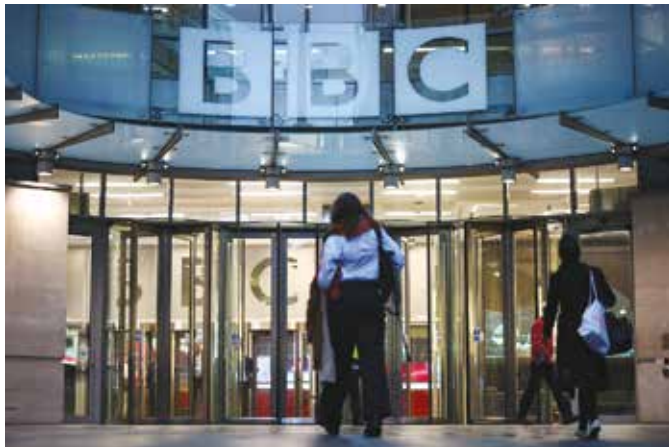
People are pictured outside the entrance to the BBC in London

Trump's lawyers threatened the British broadcaster with a billion-dollar lawsuit on Monday, according to a letter seen by AFP, as the BBC apologised