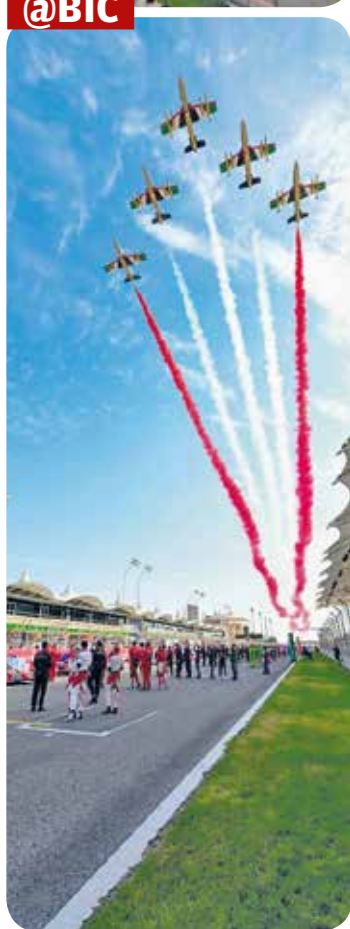
A stunning air display was held in the skies above Bahrain International Circuit yesterday prior to the start of the Bapco 8 Hours of Bahrain, the grand finale of the 2022 FIA World Endurance Championship.