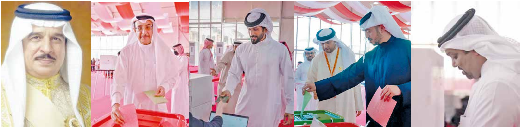
Deputy Prime Minister and Minister for Infrastructure, Shaikh Khalid bin Abdulla Al Khalifa, HH Shaikh Nasser, HH Shaikh Khalid and Finance Minister Shaikh Salman during voting yesterday