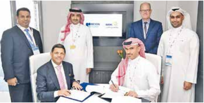
The deal signing

● Beyon Cyber to provide advanced Cyber defence security services for BBK