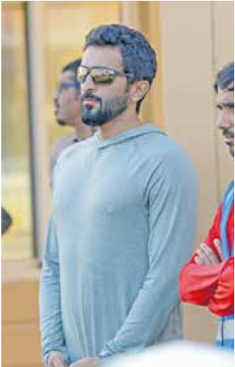
HH Shaikh Nasser bin Hamad Al Khalifa looks on during the race

The winners of the top places were crowned by His High-