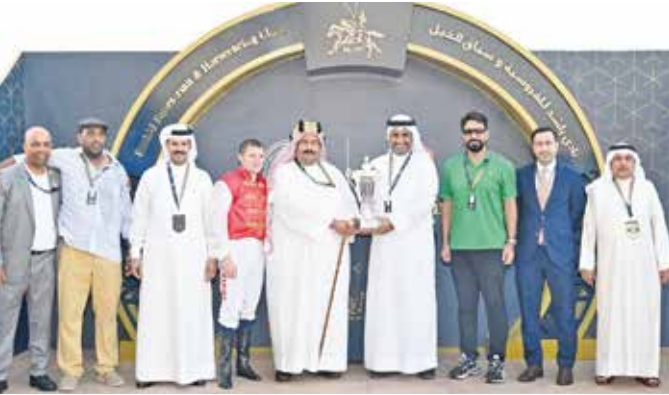
Winners from yesterday's races