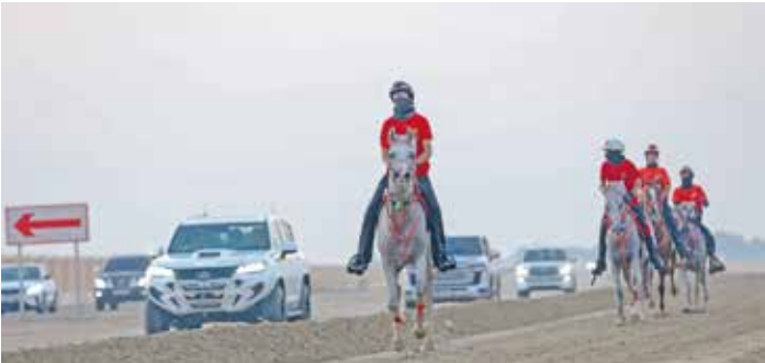
Participants in action

strong competition in the races organised by BREEF confirms the extent of the expansion witnessed by the endurance sport and the perfect preparation of the stables to participate in the local competitions which are being developed year-in, year-out in an effort to enable the Kingdom continues having positive results abroad.