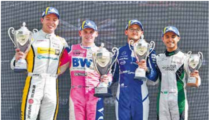
The Porsche Sprint Challenge race winners celebrate on the podium

Michelisz, from Hungary, steered his Hyundai Elantra N TCR to first place in the WTCR event after starting from sev-