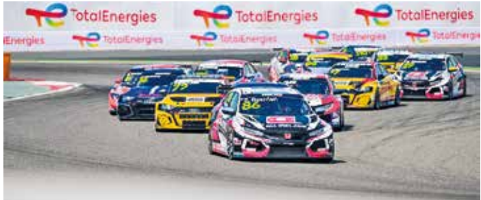
Action in the second race of the WTCR Race of Bahrain

The tournament was a J4-level competition on the ITF World Tennis Tour Juniors Calendar 2022. It followed two previous competitions held in the Kingdom, which were both at the J5 level. The action took place over three successive weeks, with youngsters from all over the world competing.