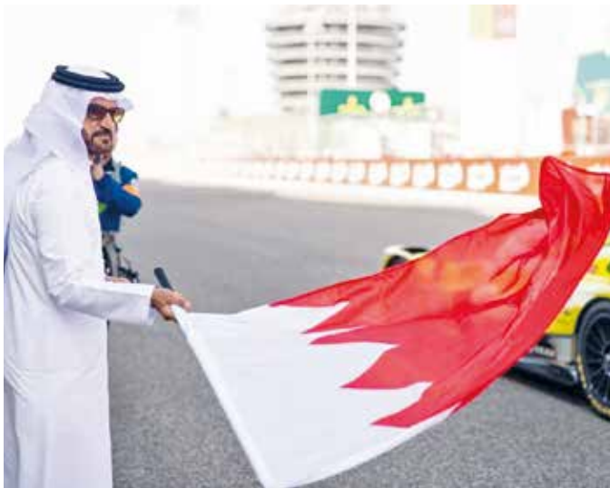
FIA president Mohammed Ben Sulayem yesterday waved the Bahrain flag to signal the start of the formation lap for the 8 Hours of Bahrain at Bahrain International Circuit