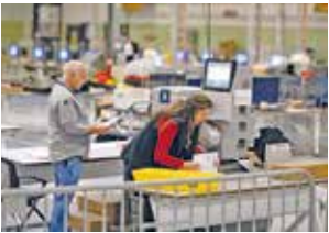
A worker prepares to scan ballots cast during the 2022 US midterm election in Philadelphia, Pennsylvania