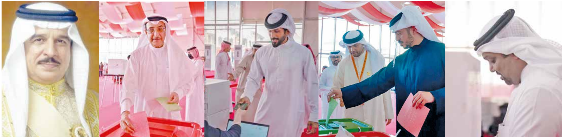
Deputy Prime Minister and Minister for Infrastructure, Shaikh Khalid bin Abdulla Al Khalifa, HH Shaikh Nasser, HH Shaikh Khalid and Finance Minister Shaikh Salman during voting yesterday

Toyota Gazoo Racing claim fantastic one-two! #7 crew of Mike Conway, Jose Maria Lopez and Kamui Kobayashi triumph in drama-filled Bapco 8 Hours of Bahrain at Bahrain International Circuit | P12