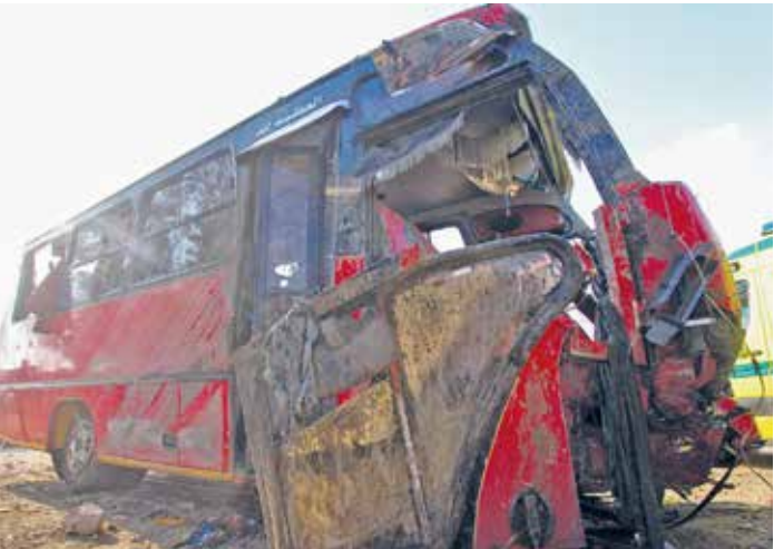
A view of the accident site