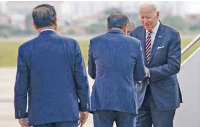
US President Joe Biden is greeted upon his arrival at the Phnom Penh International Airport

US President Joe Biden yesterday referred to Cambodia, which is hosting an international summit led by Southeast Asian leaders, as Colombia. "Now that we're back together here in Cambodia, I look forward to building even stronger progress than we've already made, and I want to thank the Prime Minister of Colombia for his leadership as ASEAN chair and for hosting all of us," Biden said while meeting his counterparts in the Association of Southeast Asian Nations in Phnom Penh. He was referring to Prime Minister Hun Sen of Cambodia, who is currently chairing the 10-member regional bloc. The president, who is on a whirlwind trip with stops at the COP27 climate summit in Egypt, ASEAN in Phnom Penh and the G20 summit in Indonesia, made