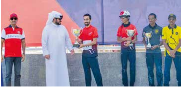
Winners with their trophies

On this occasion, His Highness Shaikh Nasser bin Hamad Al Khalifa stressed that the