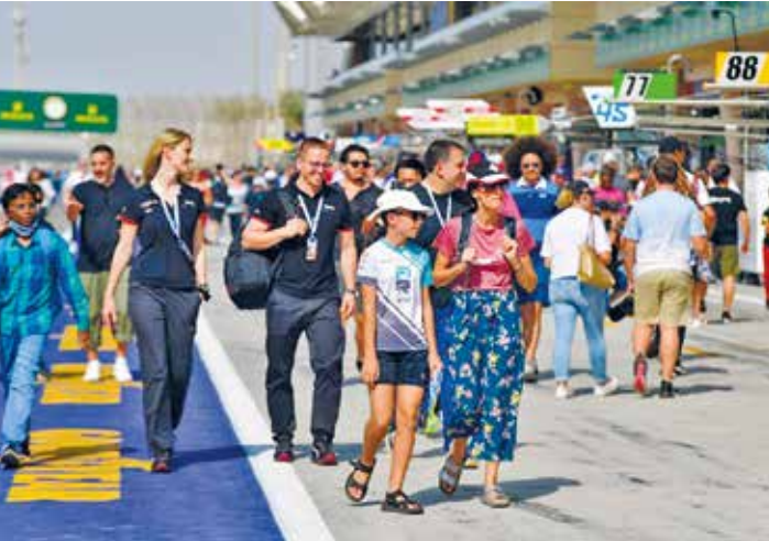
Bahrain International Circuit (BIC), "The Home of Motorsport in the Middle East", welcomed scores of fans yesterday for a Pit Walk and Autograph Session, held on the sidelines of the Bapco 8 Hours of Bahrain, the final round of the 2022 FIA World Endurance Championship. In the Pit Walk, race-goers were able to see the WEC teams and their cars in their garages while their mechanics and engineers were hard at work. The Autograph Session took place during the Pit Walk, and fans were able to meet their favourite WEC stars, who took pictures and signed all kinds of memorabilia. Above left, fans walk along the pit lane, and above right, Alpine Elf Team drivers sign autographs for the fans