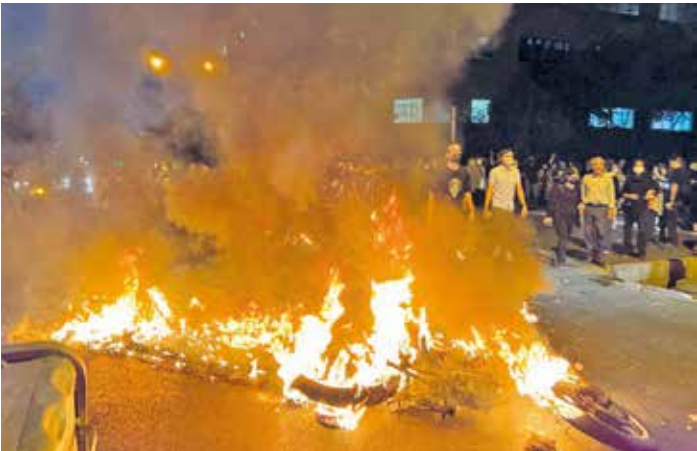
A police motorcycle burns during a protest

Iran's hardline judiciary has indicted 11 people over the killing of a Basij security force member during unrest, state media reported yesterday, as authorities sought to quell nine weeks of protests. News agency IRNA said some of the 10 men and one woman were charged with "corruption on earth", which can be punishable by death, for crimes that led to the death of a member of the pro-government Basij volunteer militia on Nov. 3 in Karaj near Tehran. The protests ignited by Mahsa Amini's death in the custody of morality police after her arrest for "inappropriate attire" mark one of the boldest challenges to the Islamic Republic since the 1979 revolution. Woman have played a prominent role, waving and burning headscarves enforced under strict dress codes. Videos posted on social media purportedly showed the national basketball team refraining from singing the national anthem during a match with China