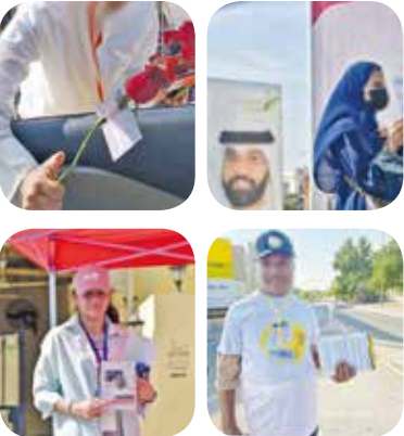
Electoral teams were seen distributing pictures of candidates and their electoral programme even after voting began, reported AlAyam