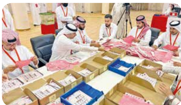
Polling and counting centres closed their doors at 8 pm sharp and immediately kick-started preparation to count votes. Right, Lieutenant General Tariq bin Hassan al-Hassan, Chief of Public Security during a visit to polling stations yesterday.