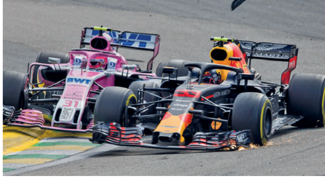
Max Verstappen of Red Bull Racing clashes with Esteban Ocon of Sahara Force India

the first lap, I was a lot faster lision.