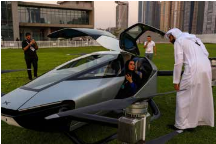
Guests and reporters check out the XPeng eVTOL flying car X2 in Dubai, United Arab Emirates