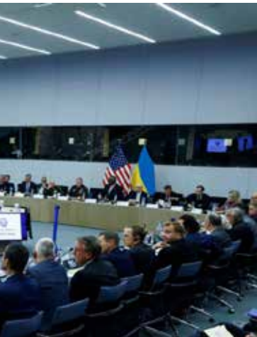
NATO Secretary-General Jens Stoltenberg speaking at a press conference

sign of a repeat of the intensive countrywide strikes of the previous two days.