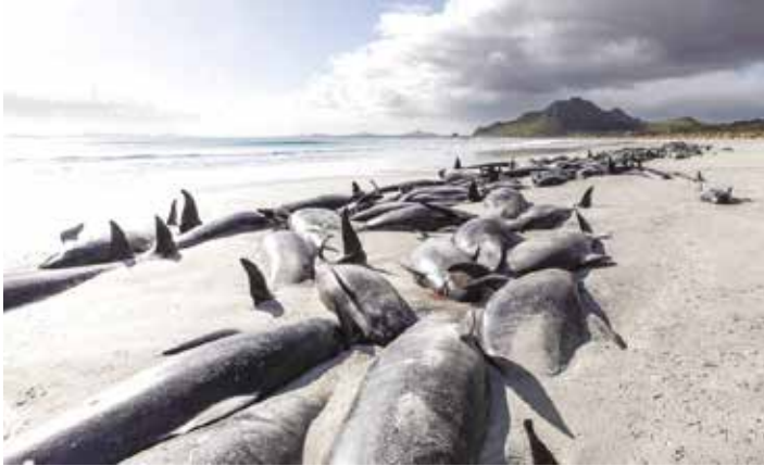
Dead pilot whales line Tupuangi Beach in New Zealand's Chatham Archipelago

The whales rescued themselves on the Chatham Islands, which are home to about 600 people and located about 800 kilometres (500 miles) east of