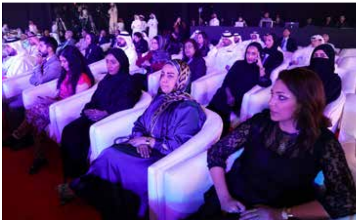
Bahrain is preparing the youth for a better future (Image for representation only)

These are some of the top findings of the 13th Annual ASDA' A BCW Arab Youth Survey, released yesterday by ASDA' A