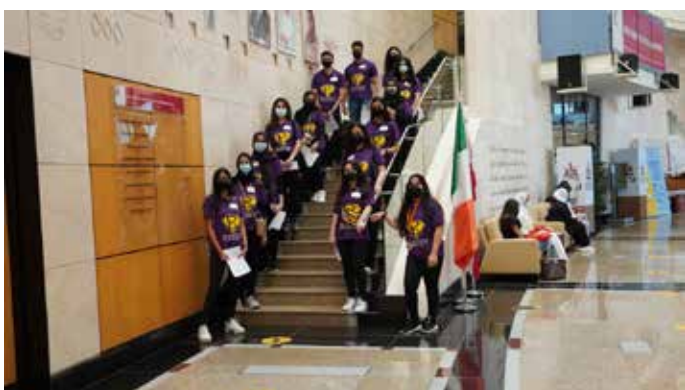
New students are taken to an induction tour

23 nationalities, with Bahraini students making up circa 50% of the new intake, 30% of the students are from the Middle East, 10% from North America, and 10% from Asia and Europe.