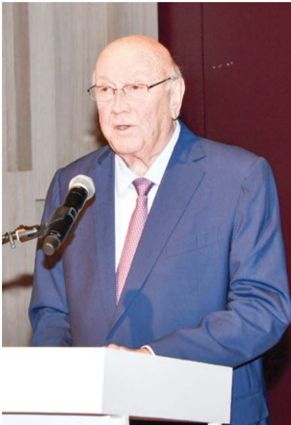
Mr de Klerk spoke on the social issues that exist in South Africa.

● Mr de Klerk spotlighted the history of the conflict in his country before achieving peace, pointing out current challenges facing South Africa. He underscored the need to promote peace worldwide and work out solutions to end ethnic, cultural and religious conflicts in some parts of the world.