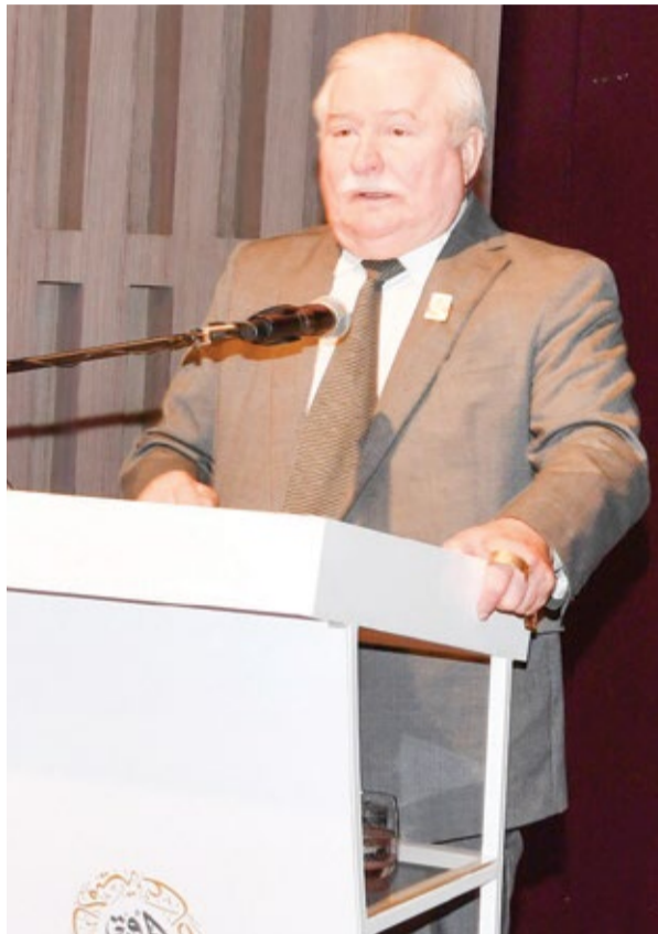
Mr Walesa highlighted economic imbalances across the world.