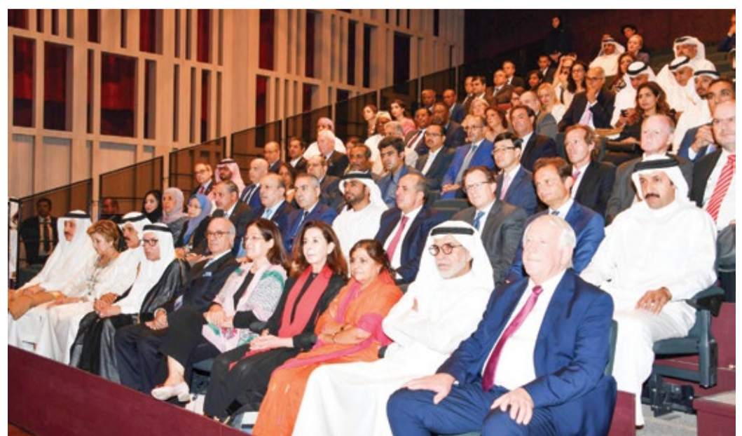
A segment of the audience.