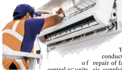
central AC units

A tender by the Ministry of Education inviting bidders for maintenance and repairs