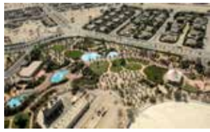
Representative picture | Manama

The Bahrain Petroleum Company (Bapco) has on offer a three-year agreement to supply sofa sets for Awali Houses.