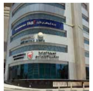
Manama

The Social Insurance Organisation has opened a tender for hiring a contractor for preventive maintenance for its offices and branches.