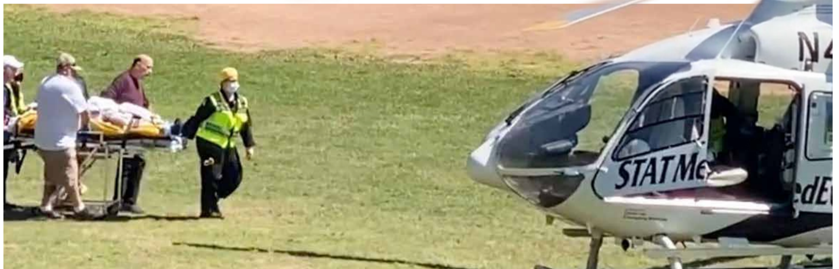
Author Salman Rushdie is transported to a helicopter after he was stabbed on stage before his scheduled speech at the Chautauqua Institution, Chautauqua, New York, U.S

A year later, Ayatollah Ruhollah Khomeini, then Iran's supreme leader, pronounced a fatwa, or religious