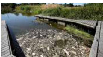
Dead fish float on the surface of the Oder river

en this week showed evidence of "synthetic chemical substances, very probably also with toxic effects for vertebrates," the German state of Brandenburg's environment ministry said on Thursday, adding that it remained unclear how the substance entered the water.