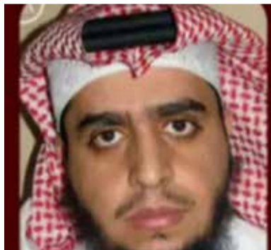
Abdullah bin Zayed Al-Shehri

The man detonated an explosive belt in the Al Samer neighbourhood in Jeddah when secu-