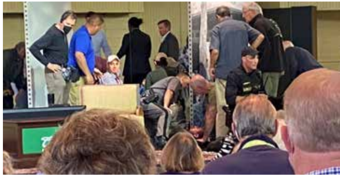
Author Salman Rushdie is treated by emergency personnel after he was stabbed on stage before his scheduled speech at the Chautauqua Institution, Chautauqua, New York

A man rushed to the stage at the Chautauqua Institution and attacked Rushdie, 75, as he was being introduced to give a talk on artistic freedom to an audience of hundreds, eyewitnesses said. A New York State Police