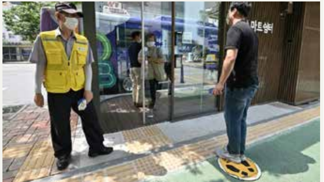
A man checks his temperature before entering the bus shelter

“We have installed all the available anti-coronavirus measures we can think of into this booth,” Kim Hwang-yun, a district official in charge of the Smart Shelter project, told AFP. Free Wi-Fi is also included. Since they were installed last week each booth has been used by about 300 to 400 people a day, Kim said. To ensure passengers do not miss their bus, a panel displays estimated arrival times while a screen live-streams the traffic outside. South Korea endured one of the worst early coronavirus outbreaks outside China but brought it broadly under control with an extensive “trace, test and treat” programme while never imposing a compulsory lockdown. Kim Ju-li, a 49-year-old housewife using the new bus stop for the first time, said: “I feel really safe in here because I know others around me had their temperatures checked as well as me.”