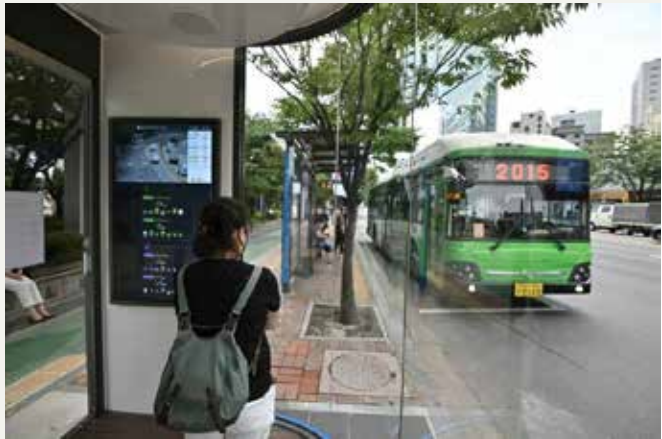
Inside the shelters, a panel displays estimated arrival times while a screen live-streams the traffic outside